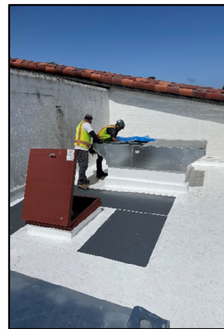
Curb Adapter Install 5400