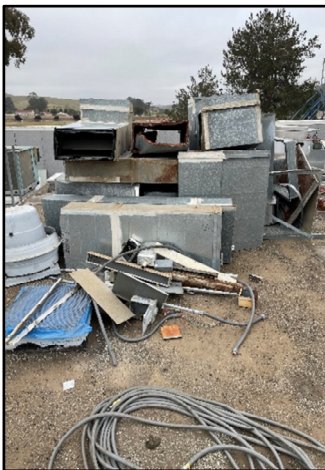
HVAC Removal 5100