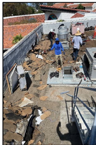
Roof Demo 5100