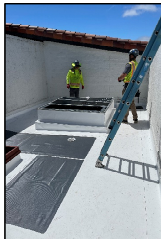
5400 Lower New Roof