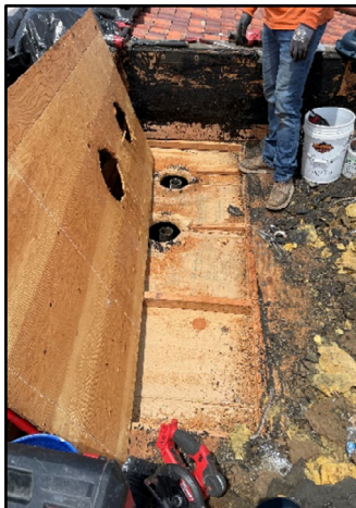
5400 Drain Replacement