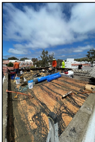
5400 Upper Roof Demo