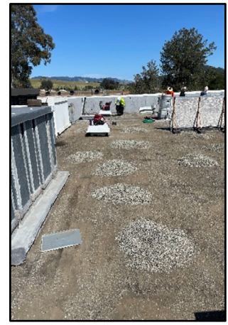
Gravel Demo 5100