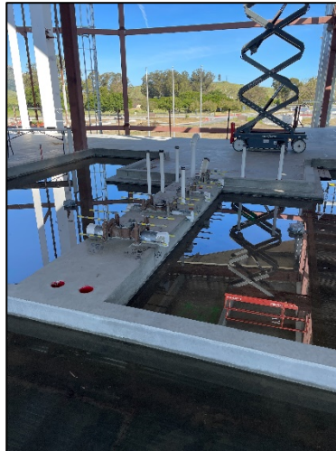
[ 2 nd Floor Plumbing Rough-In ]