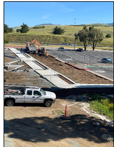
[ Parking Lot 3 Drive Isle ]