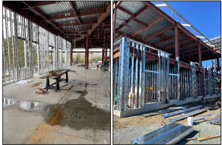
[ Exterior Framing ]

Noise: Loud noise from equipment & trucking Parking: None Utilities: No Interruptions Odors: None