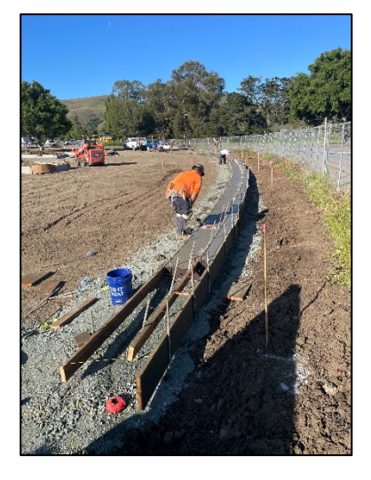
[ Parking Lot 4 Curb ]