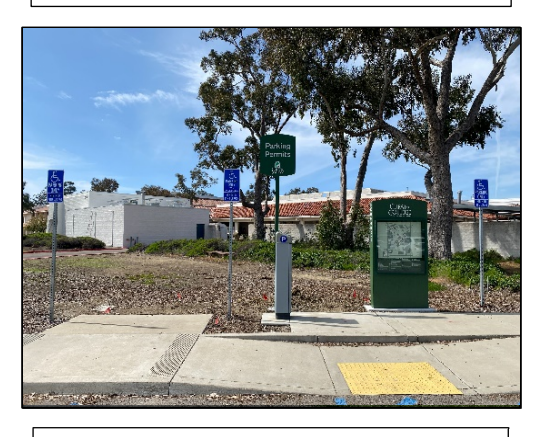
Parking Ticket Machine Signage