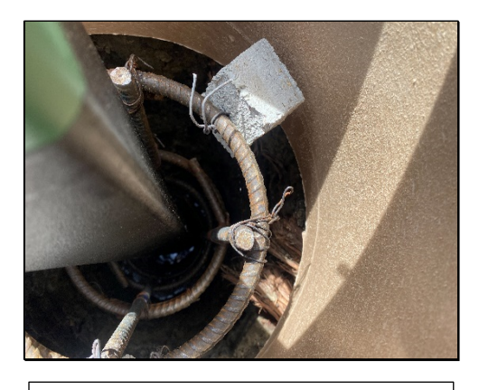
Sign Footing w/ Rebar Cages