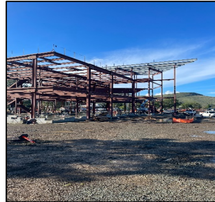
Structural Steel Erection