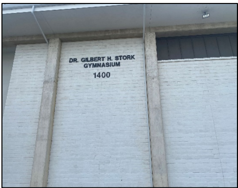
Building 1400 Installation