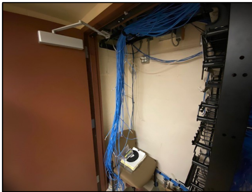
Original TR Closet Configuration

The project will be completed by February 23, 2024.