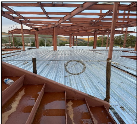
2 nd Floor Metal Decking