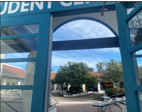
Building 5100 Demo