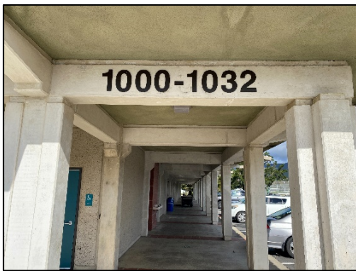
Building 1000 Installation

In the upcoming month, the contractor will continue the ID signage installation at the 5000, 6000, and 7000 Complexes.