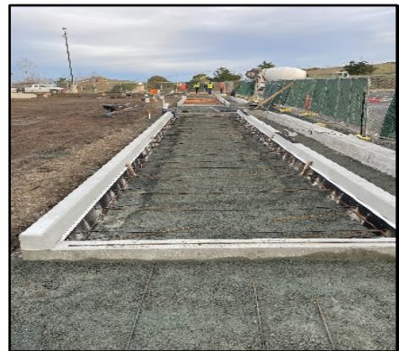
Grade New Sidewalk – Lot 3