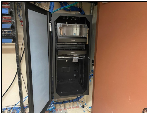
New Network Cabinet