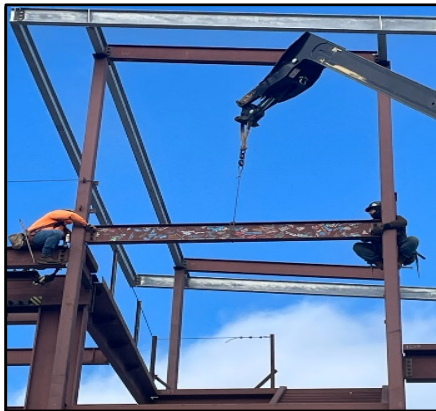
Setting Signed Beam

In the upcoming month, the contractor will finish the structural steel erection and metal decking while continuing to progress on the site improvements. The project remains on schedule per the critical path.