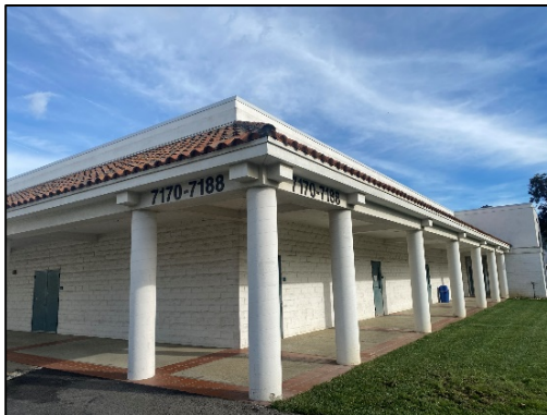
Building 7100 Installation