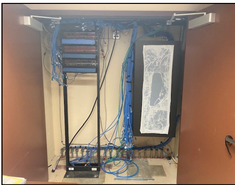
New TR Closet Configuration