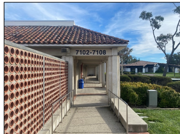
New Install - 7100