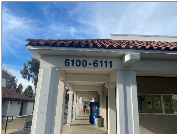
New Install - 6100