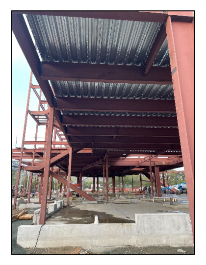
[ 2<sup>nd</sup> Floor Metal Deck Installation ]