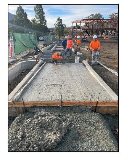
[ Pedestrian Flatwork ]