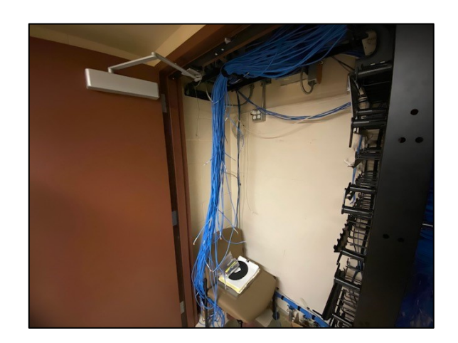
Future AV Rack Location