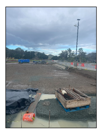
[ Parking Lot 3 Expansion – Retaining Wall ]