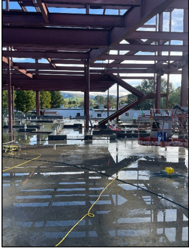
[Structural Steel Erection]