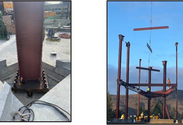
[ 1st Structural Steel Column Set ]