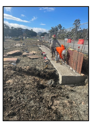
[ Asphalt Saw-Cut Lot 3 Expansion ] [ Grade New Sidewalk - Lot 3 ]