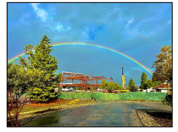
[ Structural Steel – Erection Activity ]