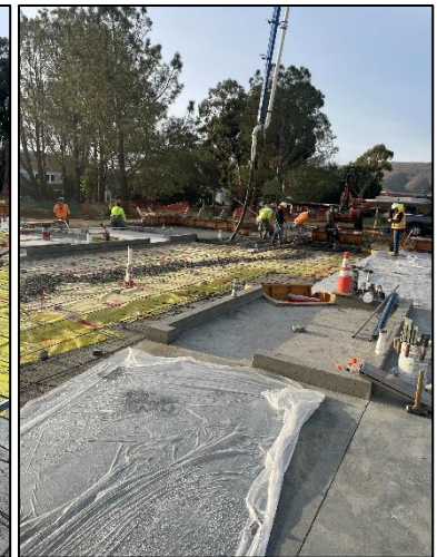
Slab on Grade Concrete Pour (West Side)