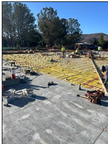
Vapor Barrier/Rebar (Lobby)