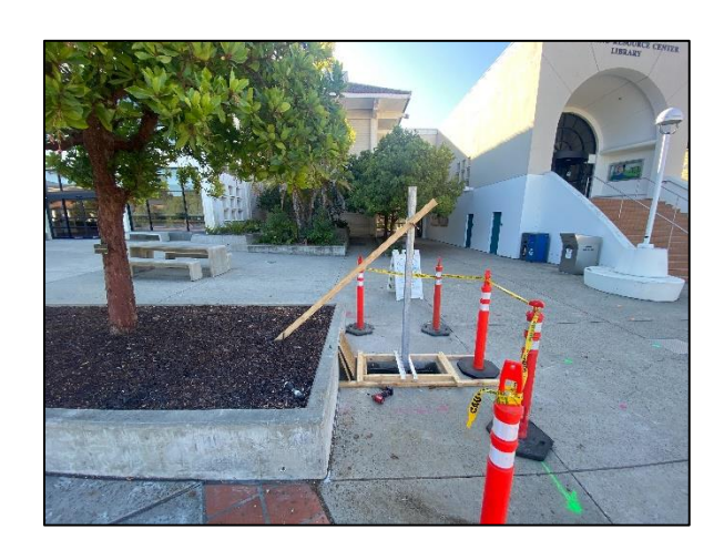
Non Powered Sign Location