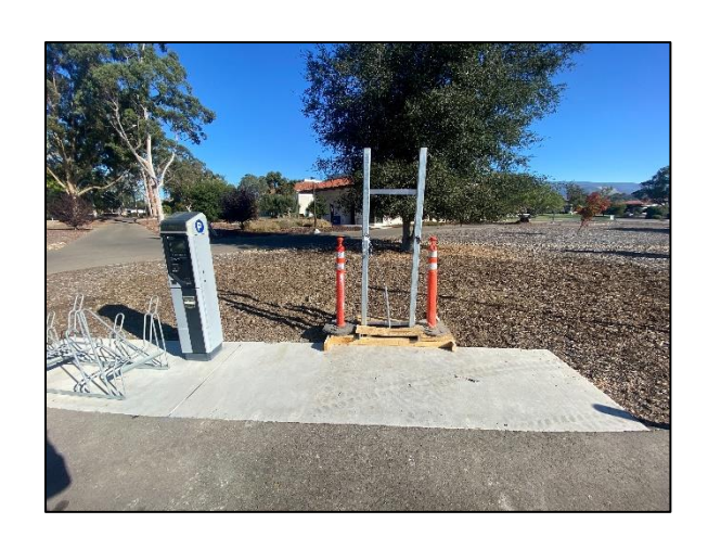
Powered Sign Location