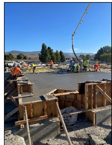
Slab Pour (West Side)