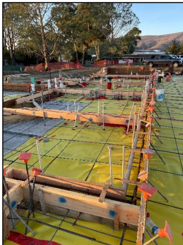
Electrical Rm. Wall Curb Forms