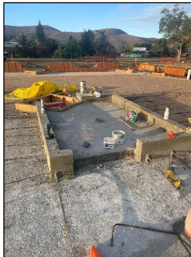
Restroom Slab & Curb (West Side)