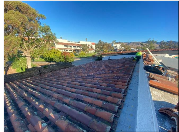
Tile Roofing – West End

Noise: Power tools & lifting equipment. Parking: No personal vehicles on site. Utilities: No Impacts Odors: None.