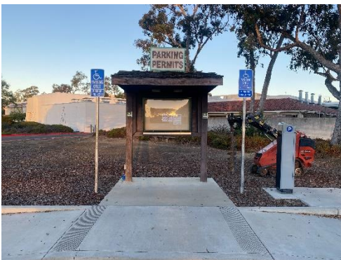
Covered Display to be Demolished

In the upcoming month, the contractor will proceed with select saw-cutting, electrical installation, concrete pouring, and sign placement. The anticipated completion date for this project is November 3, 2023.