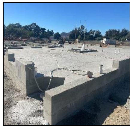
East 1/3 Slab-on-Grade Concrete