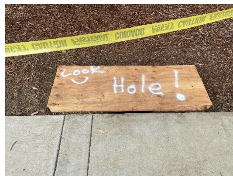
Covered Footing Location