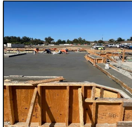
East 1/3 Slab-on-Grade Pour