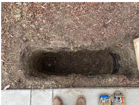
Directory Signage Footing