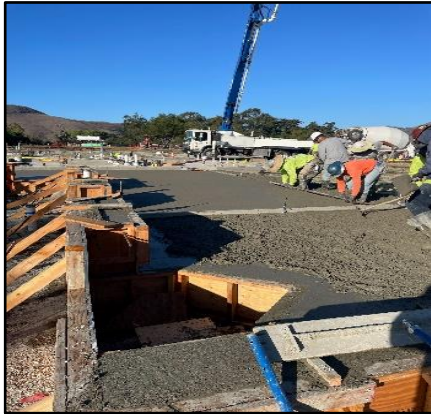
East 1/3 Slab-on-Grade Pour

In the upcoming month, the contractor will continue to form and pour the building slab-on-grade while steel material identification commences. The project remains on schedule.