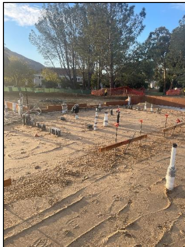
Under Slab Sand (West Side)