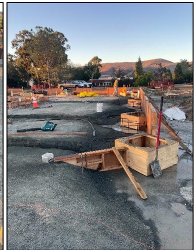
Perimter Wall Footing Form Boards (West Side)