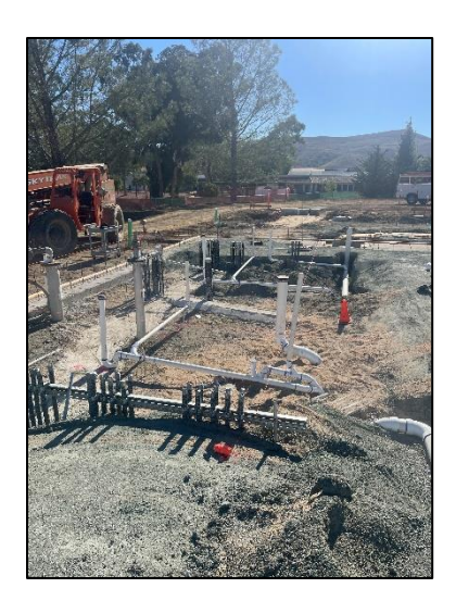
Under Slab Plumbing (West)