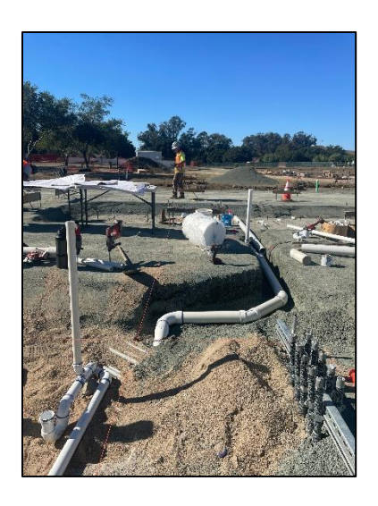
Under Slab Plumbing (West)