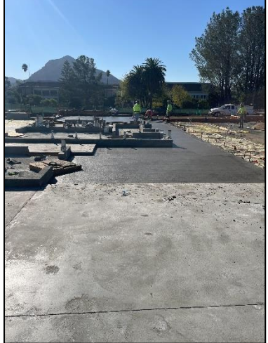
Perimter Wall Curb (East Side) Slab On Grade (East Side)