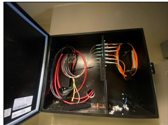
Fire Alarm Splice @ 6100