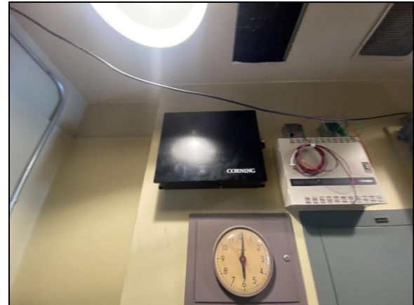
New F.A. Splice Enclosure