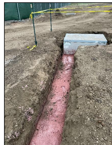
Site Electrical into Bldg.