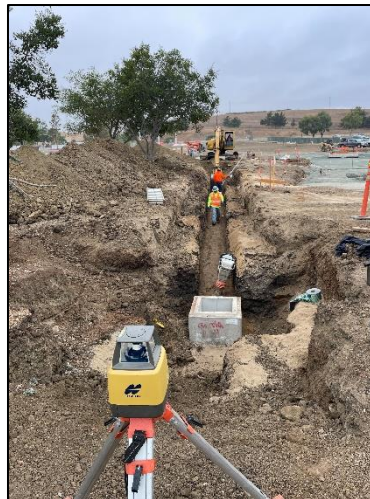
Site Storm Drain