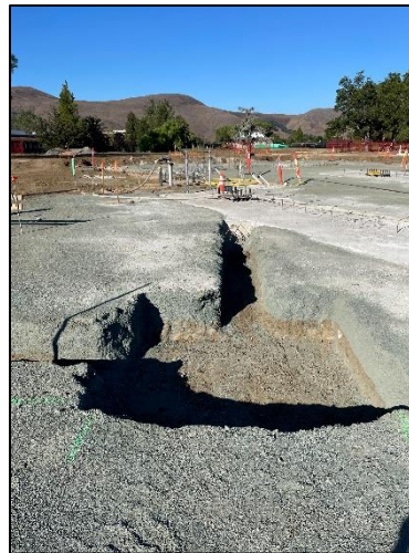
Pad Footing & Tie-Beam