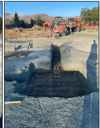
Pad Footing w/ Rebar