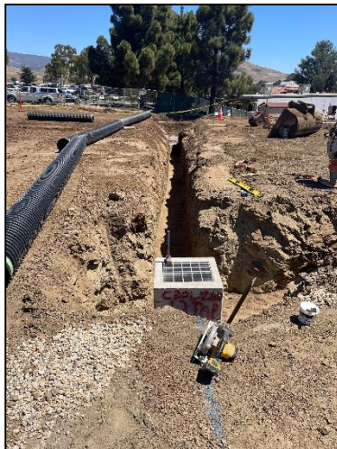
Site Storm Drain