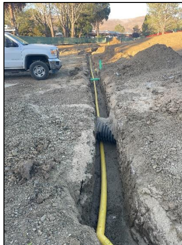
Site Gas Main Line