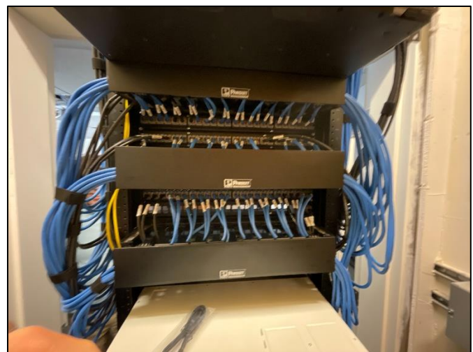
2800 Terminations Corrected