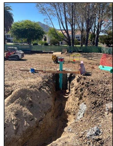
[ Site Fire Dept. Connection ]