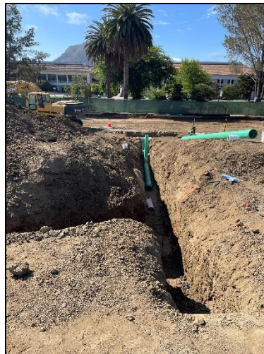
[ Site Storm Drain Piping ]