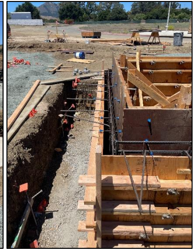
[ Elevator Pit Wall Rebar ] [ Elevator Pit Wall Formwork ]