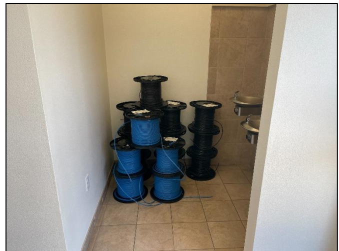
Remaining cable pulled Friday