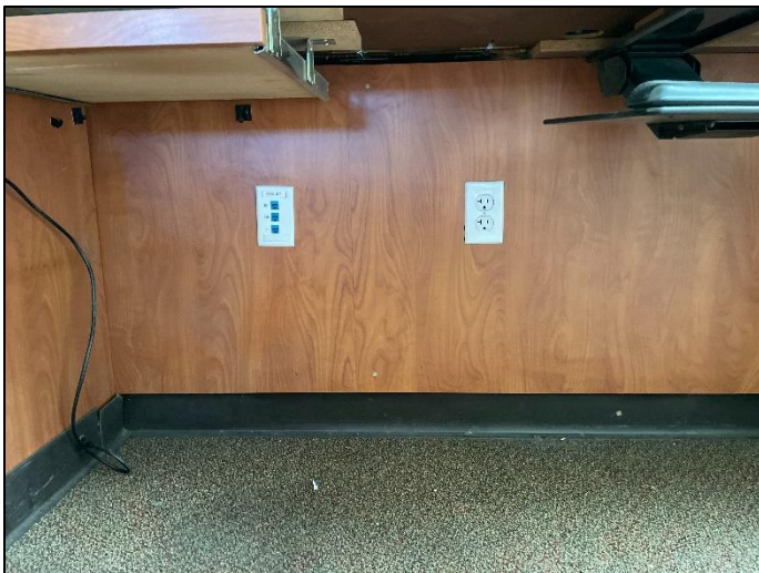
Data Portes in Cabinetry.