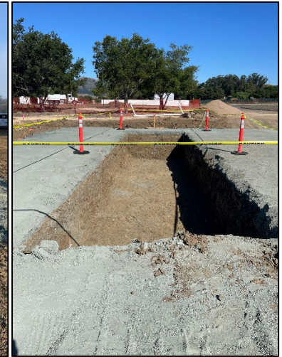
[ Building Grade Beam ]