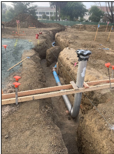
[ Fire Water Riser Pipe ]