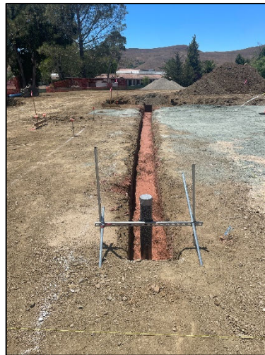
[ 12kv Electrical Conduit ]