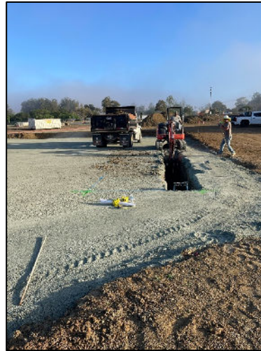
[ Excavating Grade Beams ]