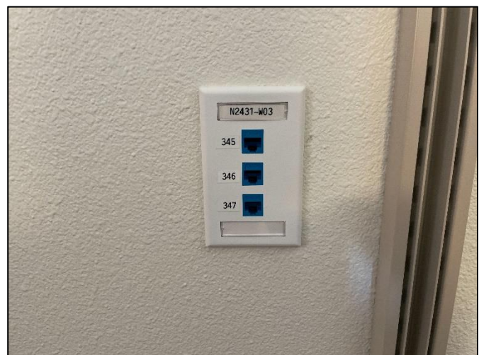
Data Ports at Interior Walls