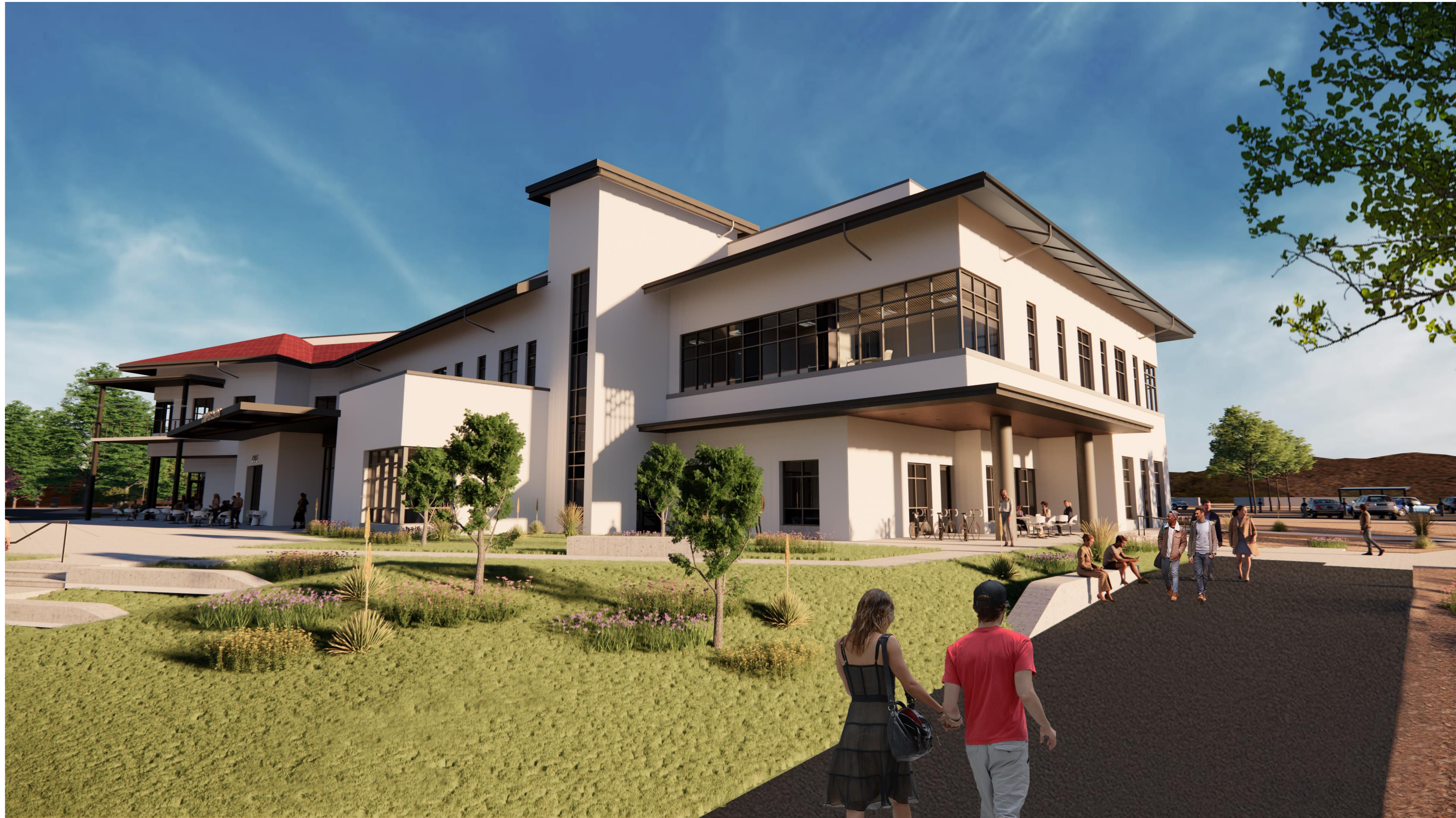
PERSPECTIVE VIEW- FROM THE CAMPUS ENTRY