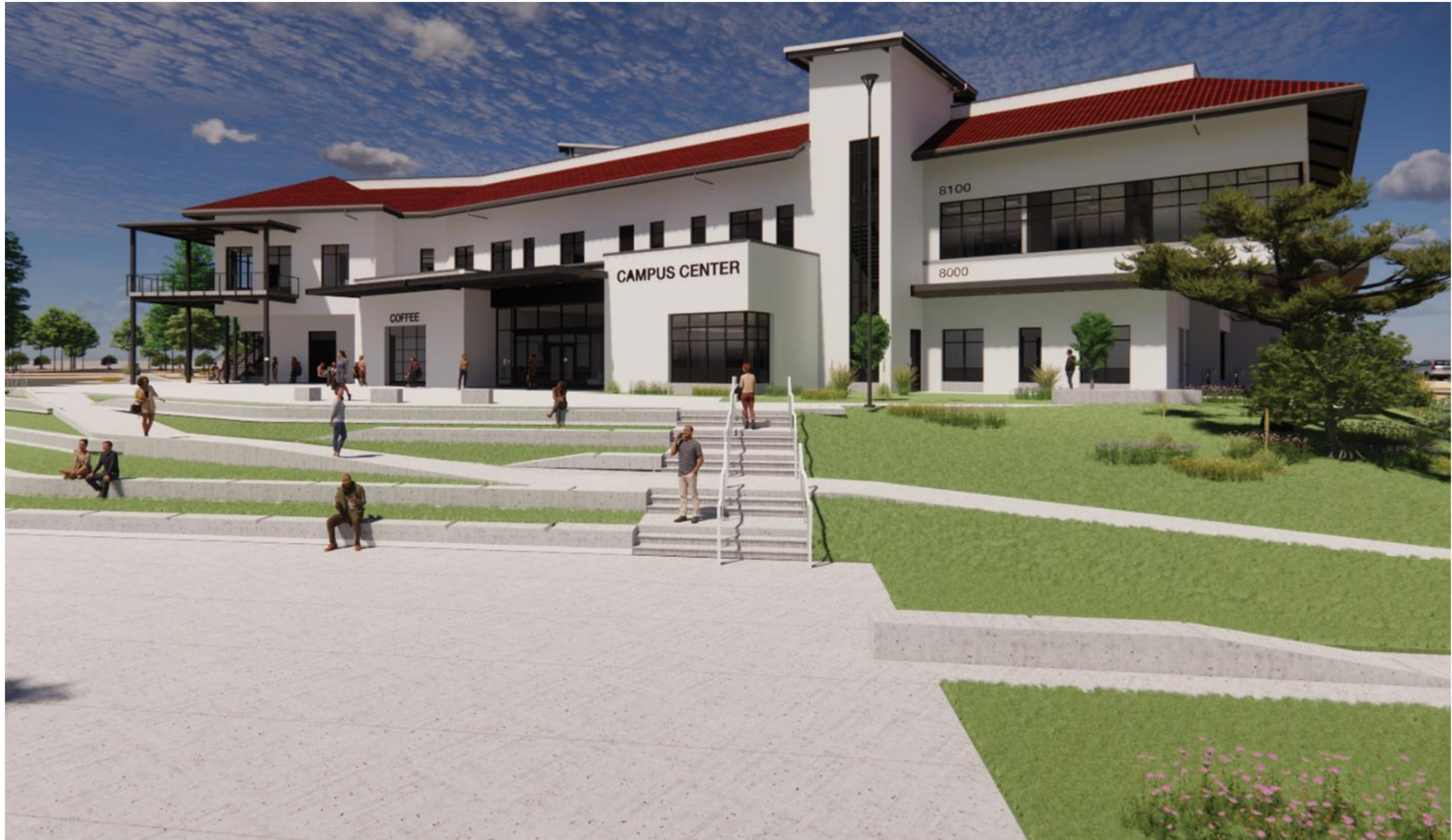
PERSPECTIVE VIEW- EXTERIOR HARDSCAPE VIEW