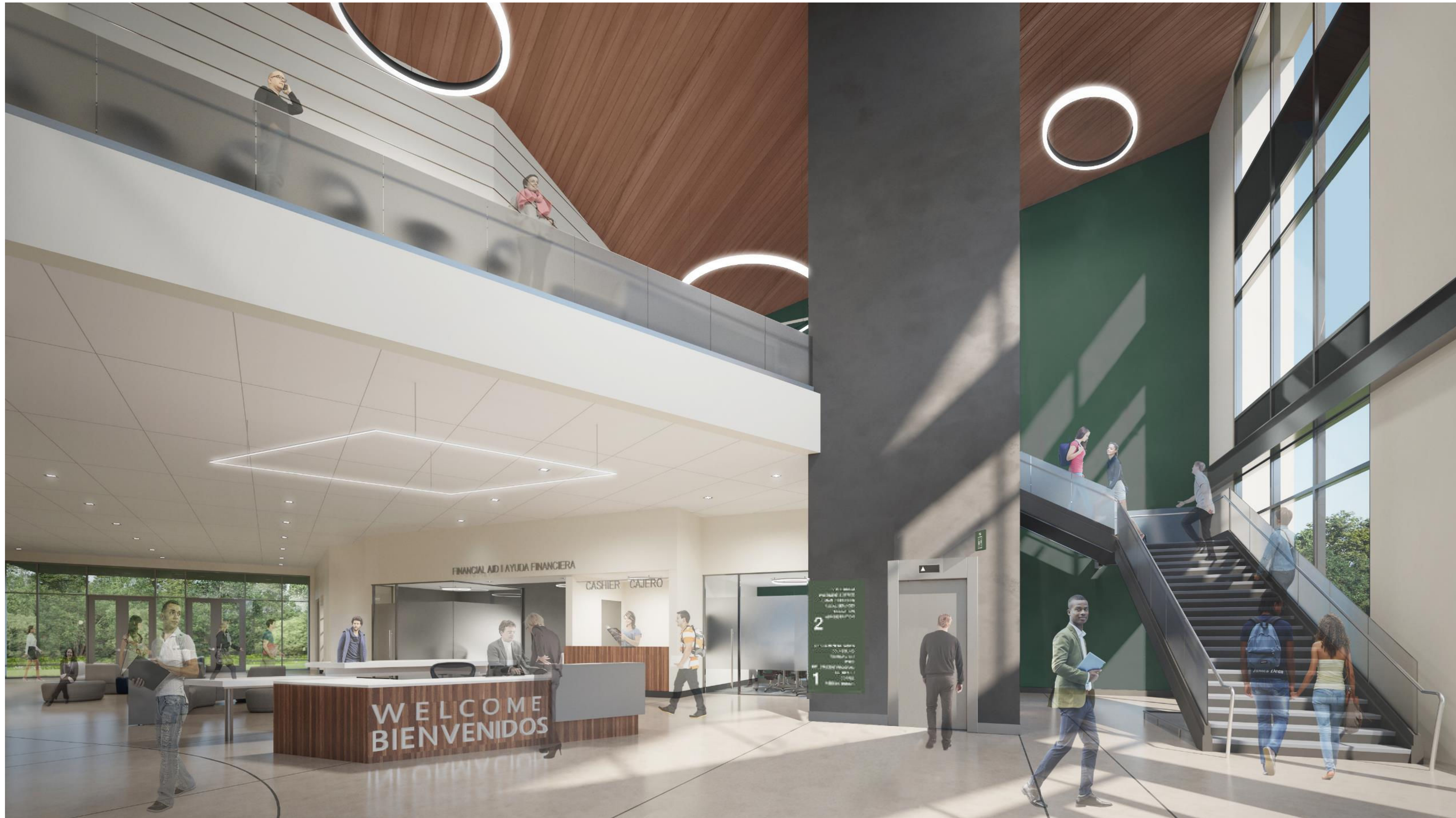
INTERIOR VIEW- LOBBY