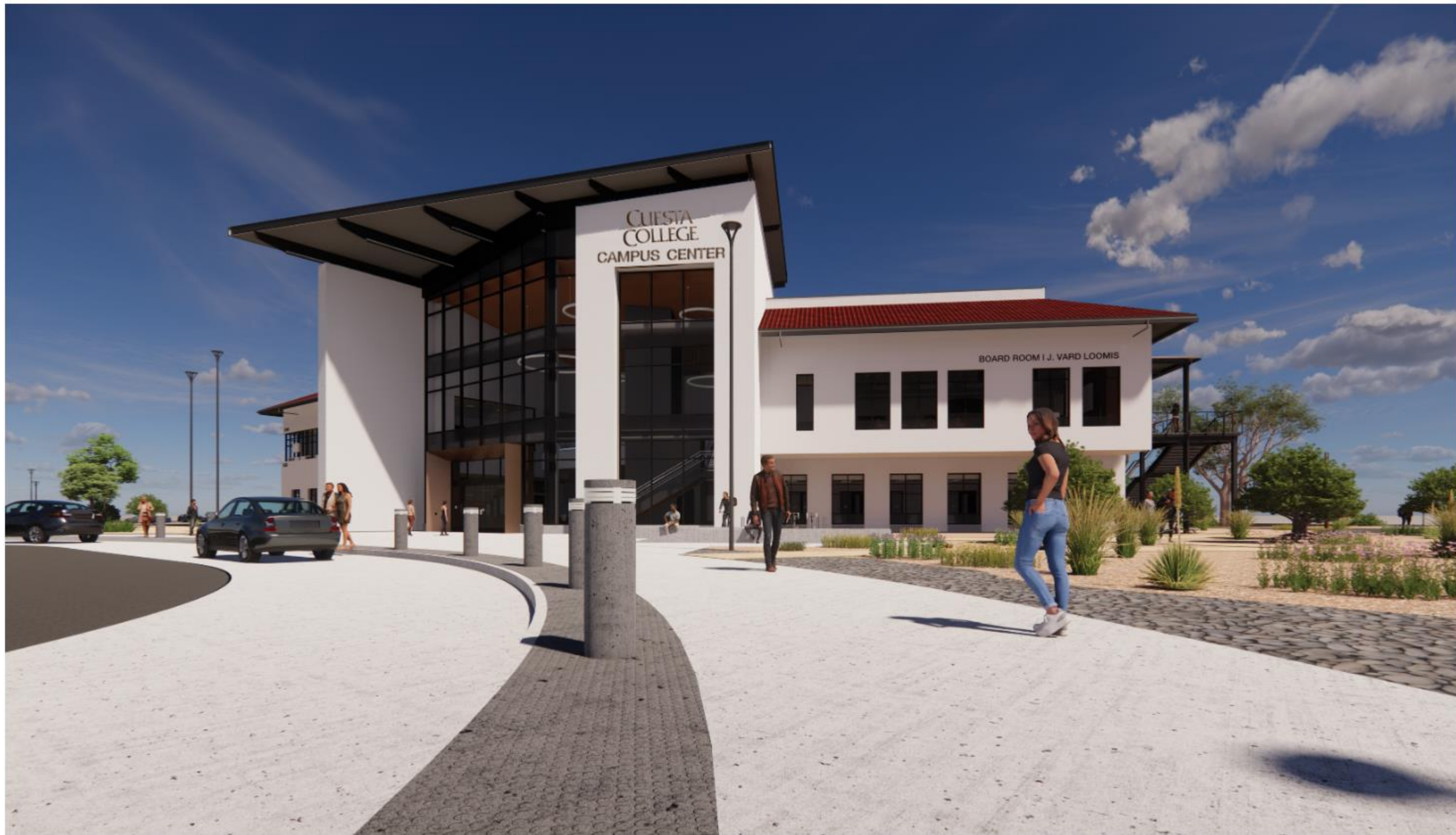
PERSPECTIVE VIEW- FRONT