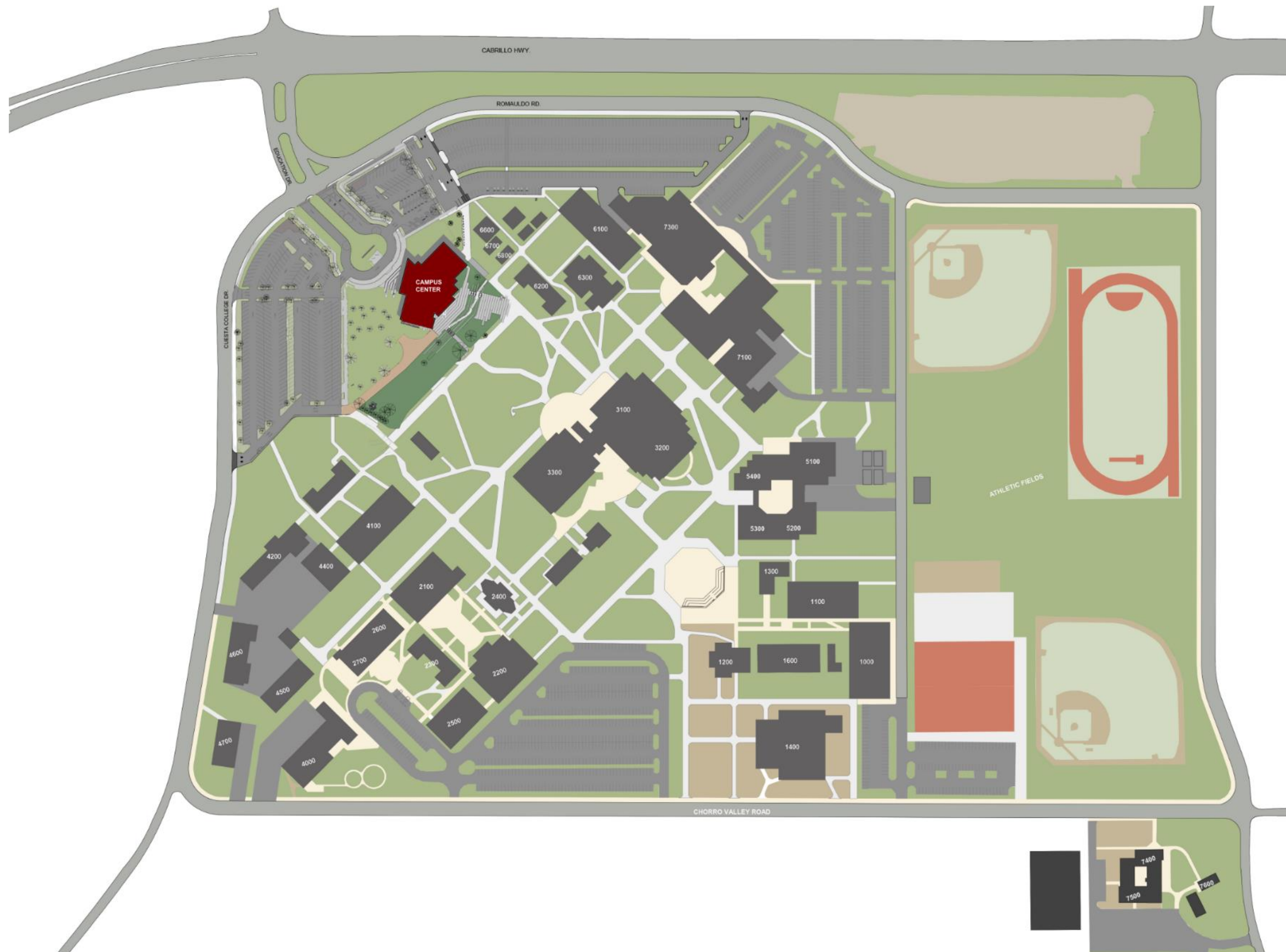
OVERALL CAMPUS SITE PLAN