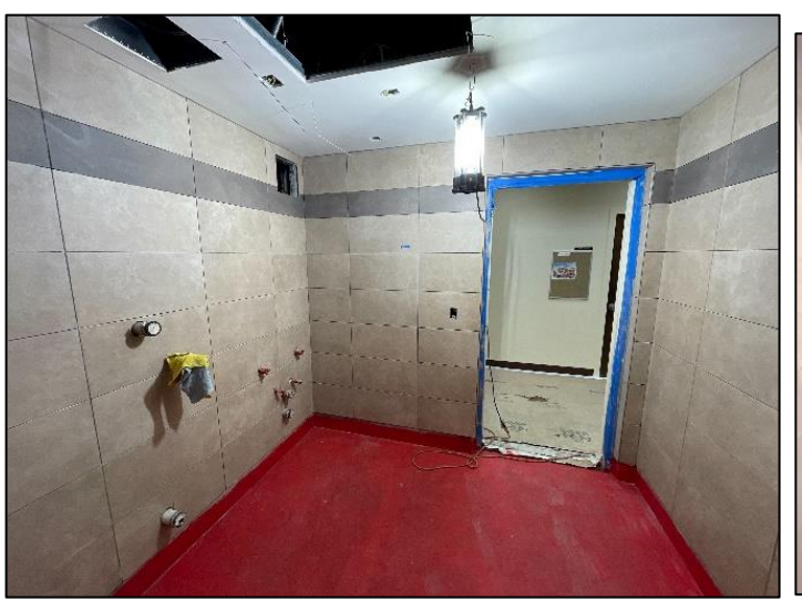
Vapor Barrier In Preparation for Lath