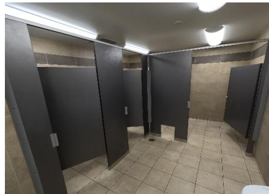
5100 women's restroom