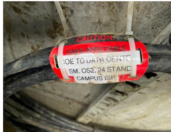
fiberoptic labeling in vaults