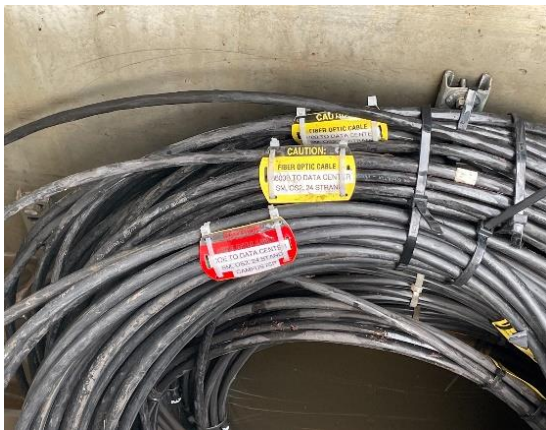
fiberoptic labeling in vaults