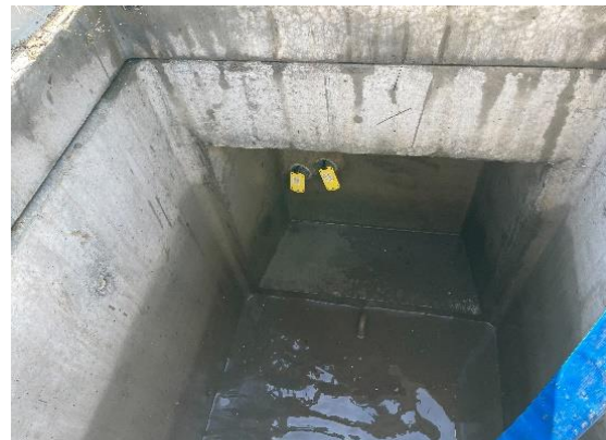
spare conduit labeling