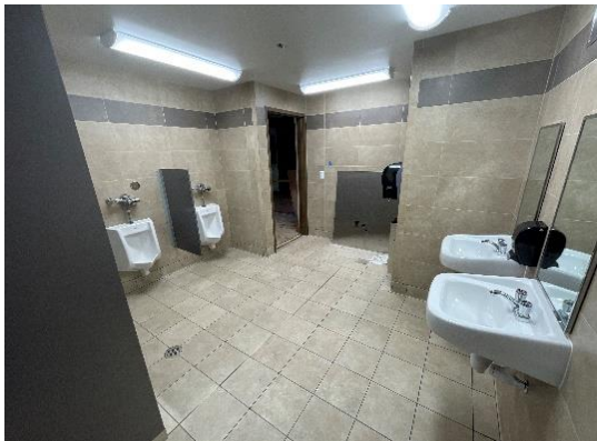
5100 men's restroom

In the upcoming month, the contractor will continue framing and fixture installation in Building 6200. The project is scheduled to be completed by the end of April.