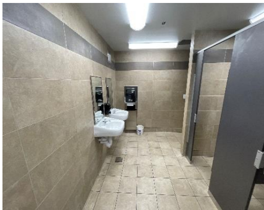
5100 women's restroom