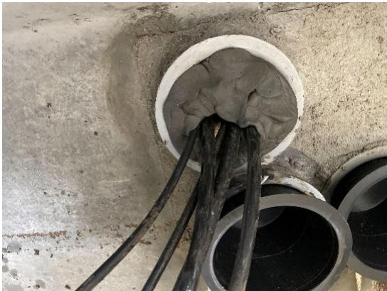
duct sealer in vaults

Project schedule will be updated once punch list has been completed and contractor is authorized to proceed with demolition scope.