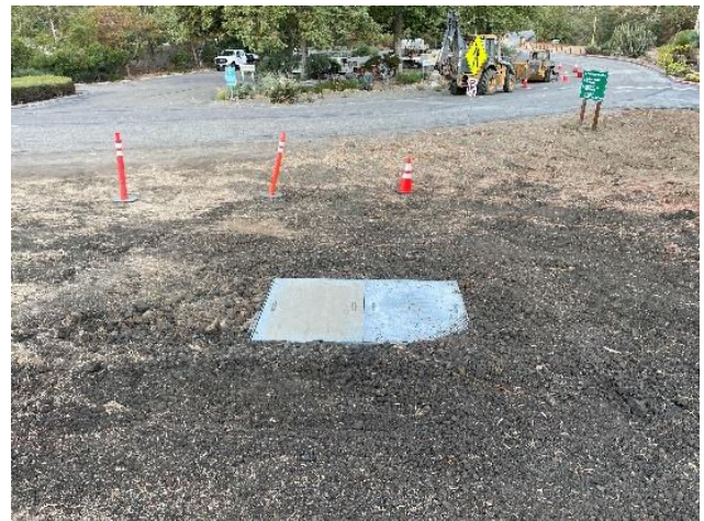
New Vault on CoE Property