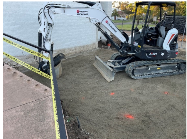
Finished Building Pad