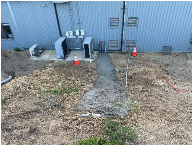
Conduit Trench to CoE Mediaplex

The specified fiber is out of stock and a substitution needs to be identified to complete the project.