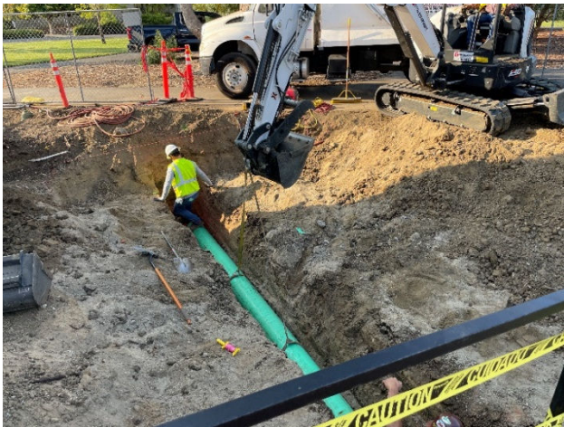
New Sewer Line

In the upcoming month, the contractor will pour the footings for the new switchgear enclosure and begin erection of the slump stone masonry walls.