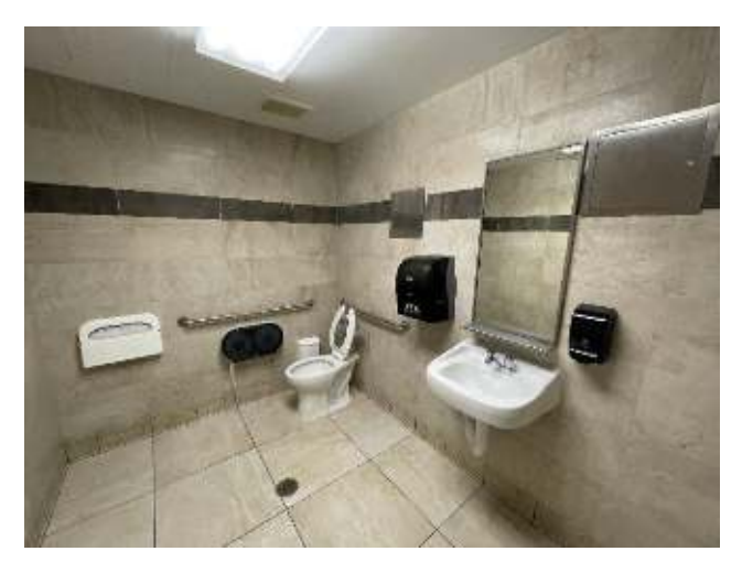
Building 4000 Faculty Restrooms Complete

In the upcoming month, the contractor will be completing the punch list items for Buildings 4000 and 1400 and will complete the contract scope of work and punch list work for Building 7100. The project is anticipated to be complete by mid-July.