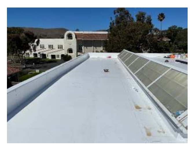
New Roofing Install for Building 7100 in Progress