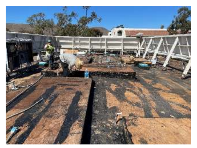
Demo of Existing Roofing/HVAC on Building 7100

In the upcoming month, the contractor will complete the demolition on Building 6100 and be nearly complete with the re-roofing along with the demo and re-roofing of Building 7100. The project is on schedule to be complete prior to the start of the Fall 2022 semester.