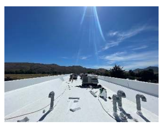
New Single Ply Roofing on Building 4000