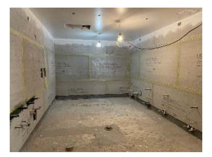
Building 7100 Restroom Progress