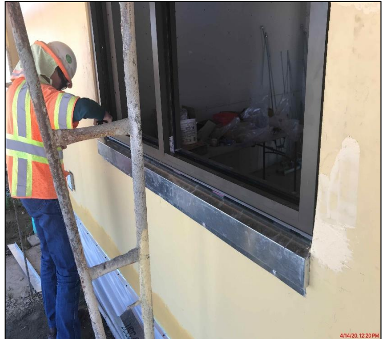
4/14/20, 12:20 PM