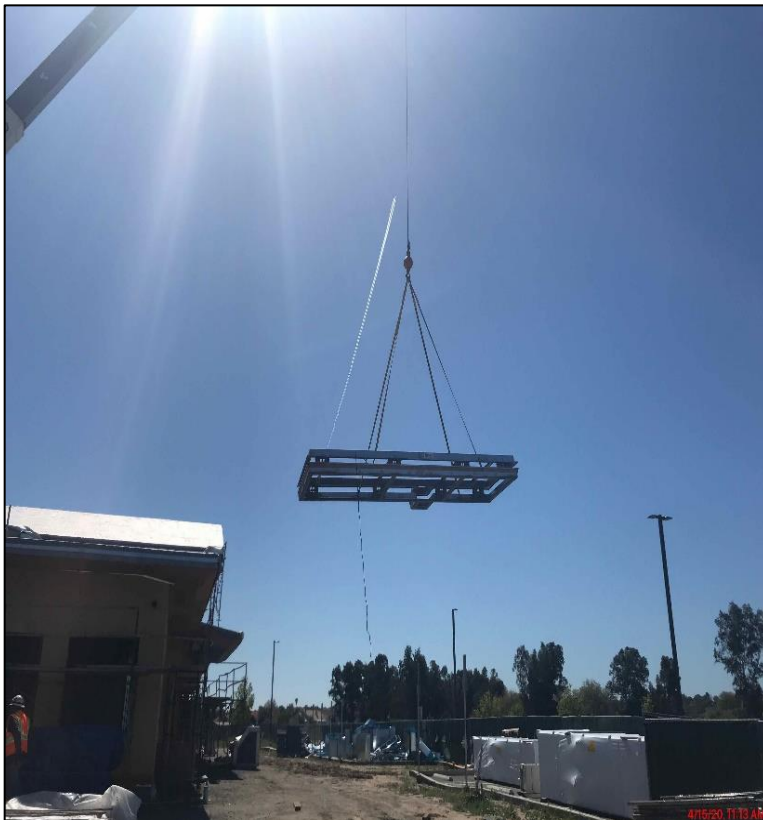
4/16/20, 11:13 AM