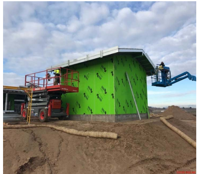
Exterior Sheathing & Dry-in of Storage Buildings