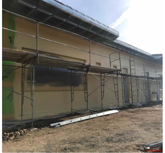
Installation of Weather Barrier