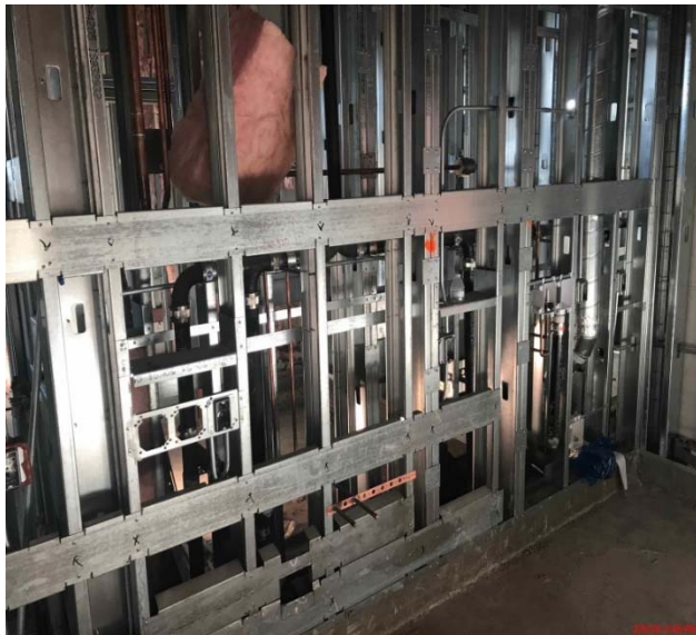
Framing & MEP Rough-in Progress

In the upcoming month, interior drywall, insulation and roof dry-in will continue. The exterior weather barrier will be completed and exterior window frames will be installed. The contractor will continue on interior MEP rough-in. The overall project remains on schedule to complete in fall of 2020.