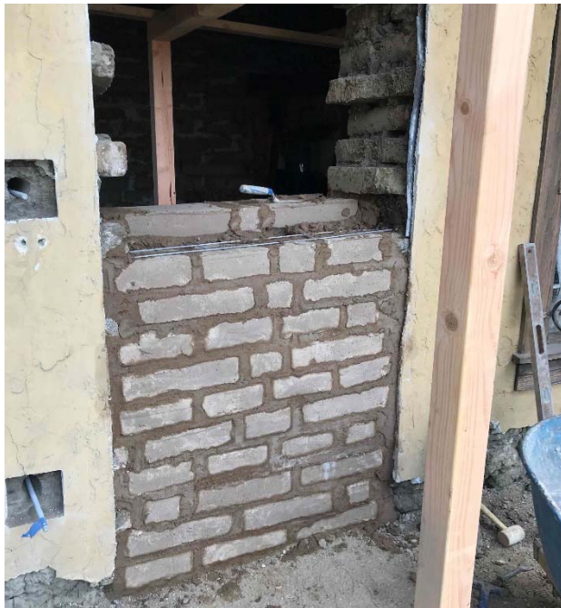
Adobe Brick Door Infill

The contractor will continue to core holes for the fiberglass rods. The doorway infill work will begin once the new adobe blocks have been delivered. The project is currently on schedule to be complete in March 2020.