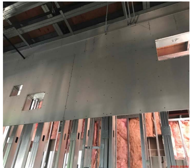
Drywall Installation Progress