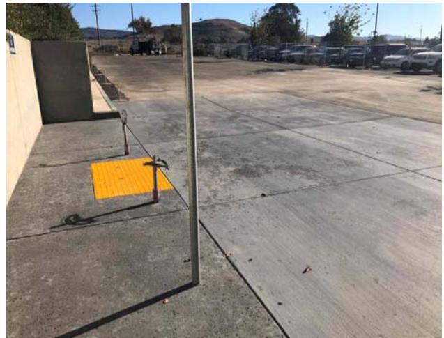
New ADA Parking Area on the SLO Campus