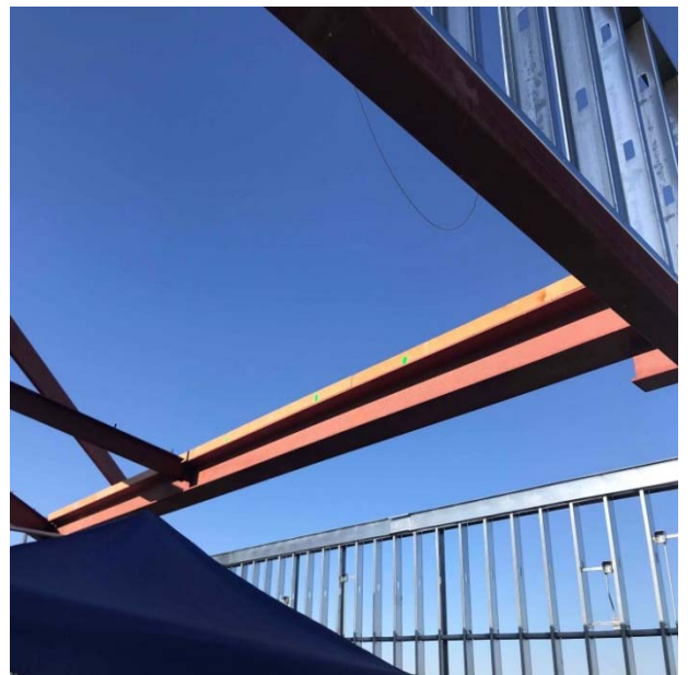
Wood Nailer Installation