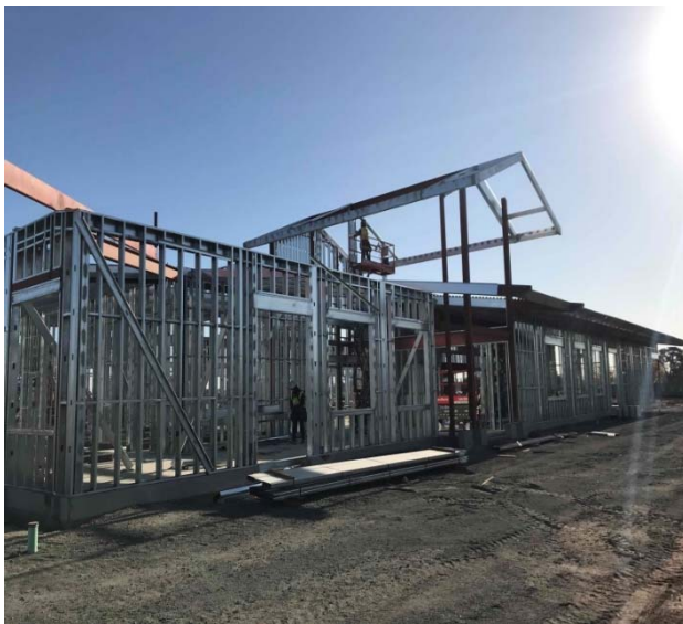
Metal Framing Progress

In the upcoming month, the exterior and interior building framing and exterior skin elements will continue. The contractor will begin drying in the roof. Interior MEP rough-in will continue, as will exterior underground utilities and grading. The overall project remains on schedule to complete in fall of 2020.