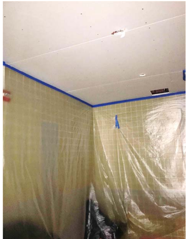
Bathroom ADA Upgrade Progress