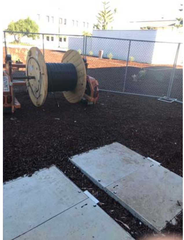
Progress of Fiber Pulls