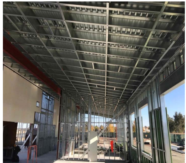
Metal Roof Decking Installation