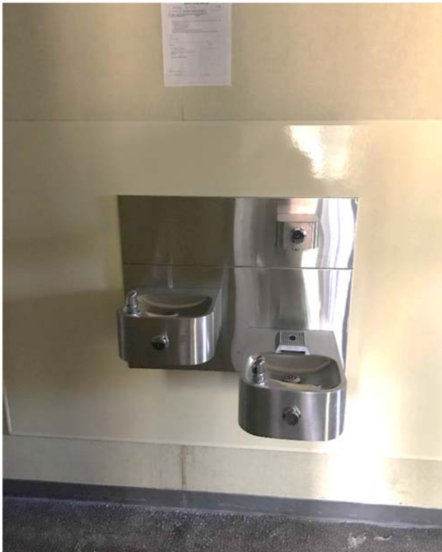
New Drinking Fountain & Hydration Station Installation

Next month the contractor will continue working on the ADA upgrades in the bathrooms and install the signage throughout the building. The project is currently on schedule to complete by December 2019.