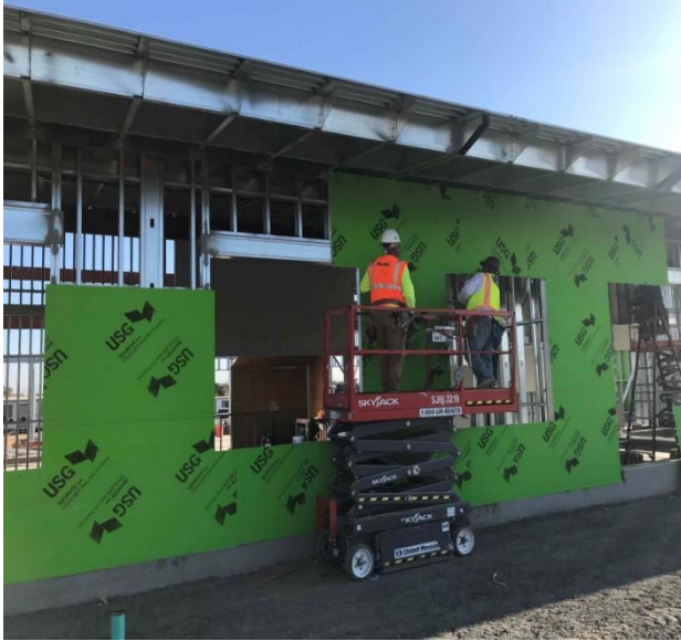
Exterior Sheathing Installation