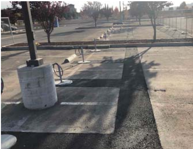
Asphalt Patch Back at the NC Campus

In the upcoming month, the contractor will paint/stripe the new parking areas and install the new electric vehicle charging stations. The project is currently scheduled with construction to be completed by early December 2019.