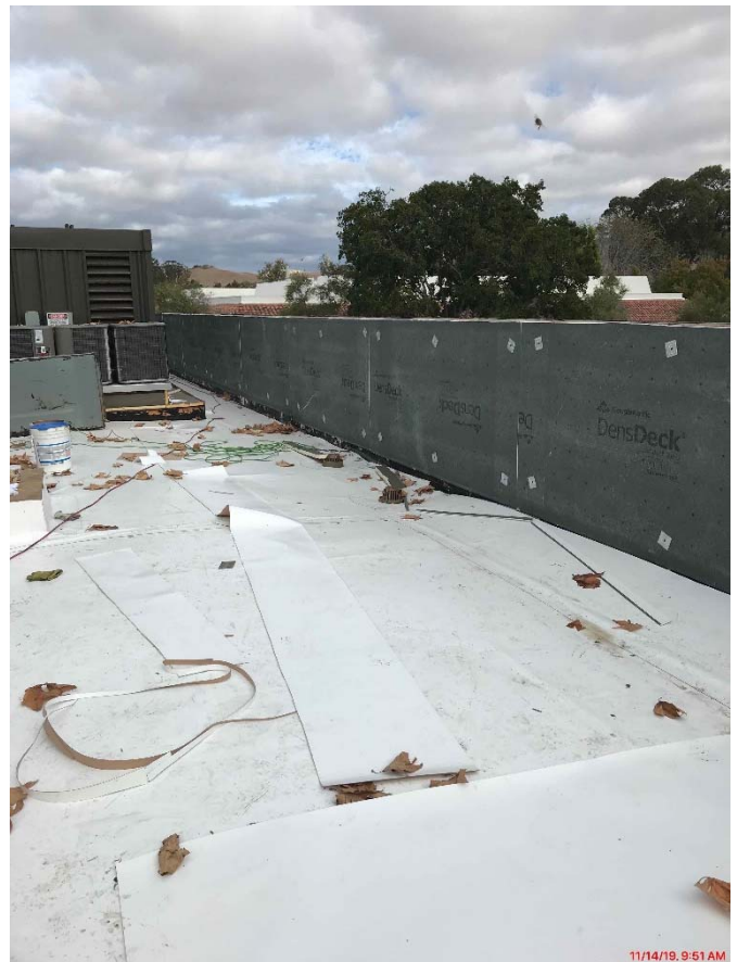
2300 Re-roofing Progress