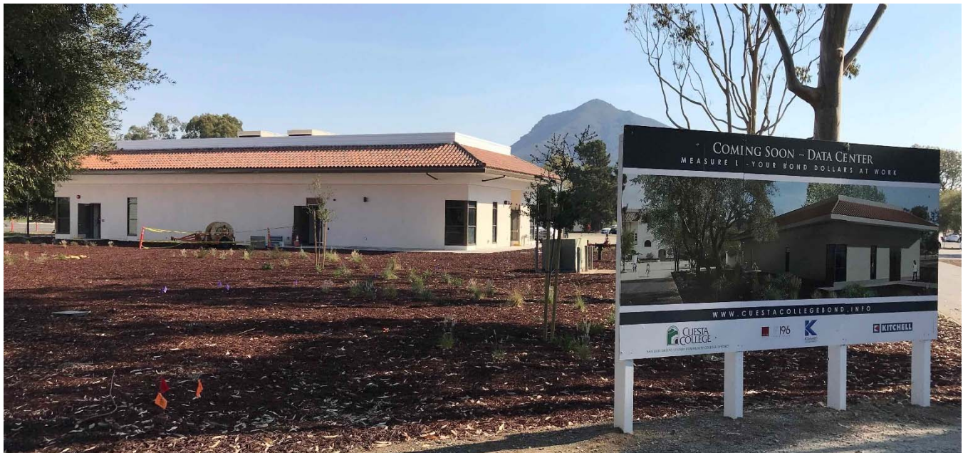
Data Center Exterior

In the month of December, the District's IT Department will be moving over the Data Center equipment from the existing server rooms in building 3300/3400 as well as complete the move into the staff offices.