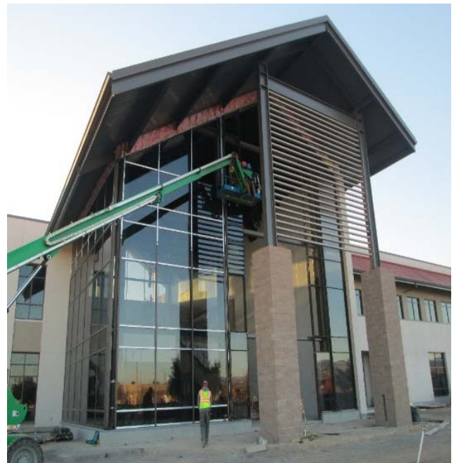
Curtain Wall Progress

Throughout the remainder of December, contractors will continue with all interior and exterior sitework activities. The specialty ceiling system at the high roof commenced earlier this month and the acoustical plaster ceilings are underway.