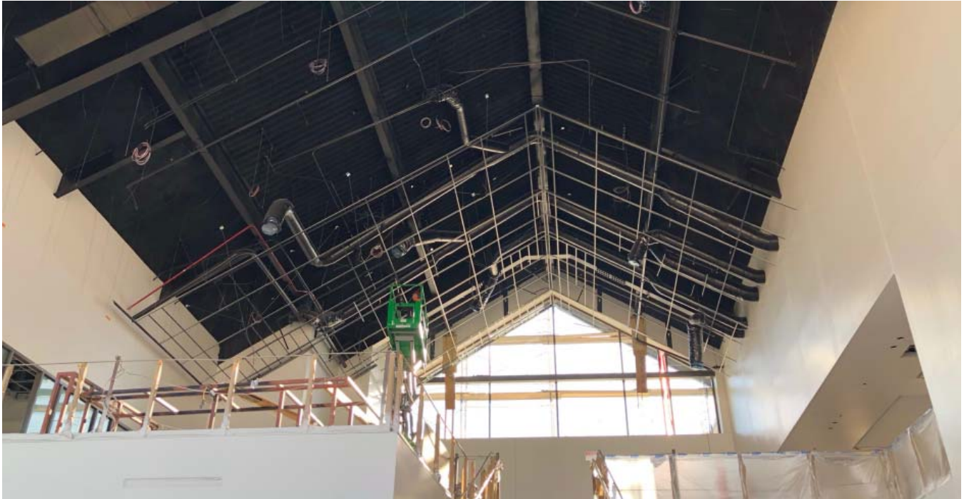
Progress on Torsion Spring Acoustical Ceiling Grid Installation