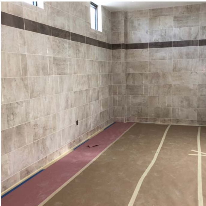
Completed 2 nd Floor Restroom Tile