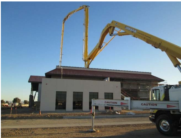
Roof Terrace Topping Slab Pour

The interior of the building continues with on-going mechanical, electrical, plumbing and fire sprinkler activities. Interior ceilings, drywall and paint continue, nearing completion with the perimeter offices. Mechanical and electrical contractors continue to follow behind the ceiling grid as it completes with various trim such as installation of light fixtures and diffusers. Ceramic Tile nearing completion at the 2nd floor restrooms and starting at the 1st floor. The concrete topping slab was poured at the roof terrace deck. The curtainwall system at the front entry is complete with the exception of one section required to be left out to allow the lift to exit the building upon completing the high ceiling. Skylight glass installation was completed earlier this month. Landscape irrigation mains passed inspection and trenches are being backfilled to prep for grading to start.