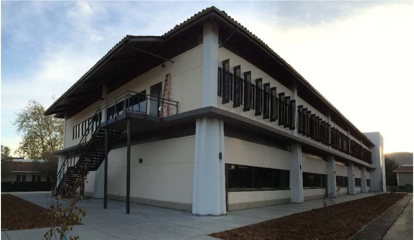
Exterior Progress of the Building