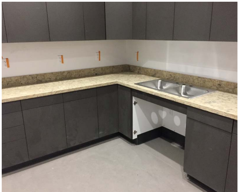
Casework & Countertop in the Kitchen