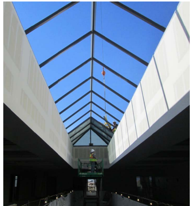
Skylight Glass Install