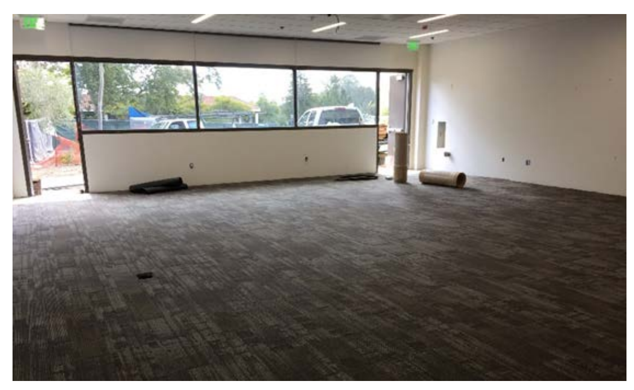
First Floor Classroom Carpet Installation