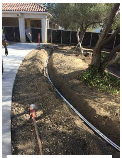
Irrigation Lines Being Installed