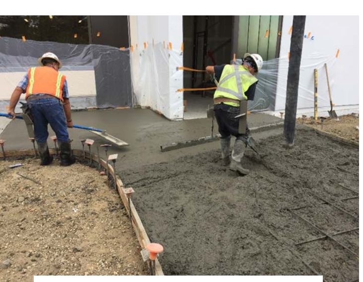
Concrete Being Poured at Stairwell