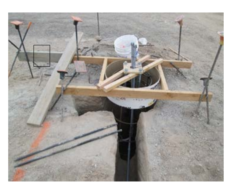
Foundation Preparation for Site Lighting