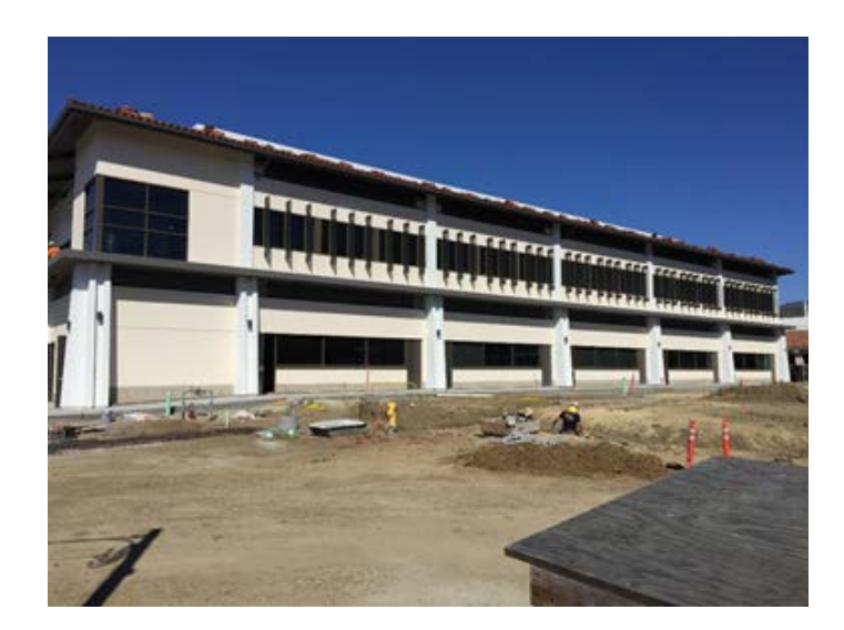
Building Exterior with Site Work

The project remains on schedule as the first floor has been completed with the exception of some miscellaneous accessories that need to be installed. The majority of the concrete has been poured and the concrete plaza is being laid out this month. The ceiling grid installation is continuing through early November. The project remains on schedule to be completed in the late fall or early winter of 2017.