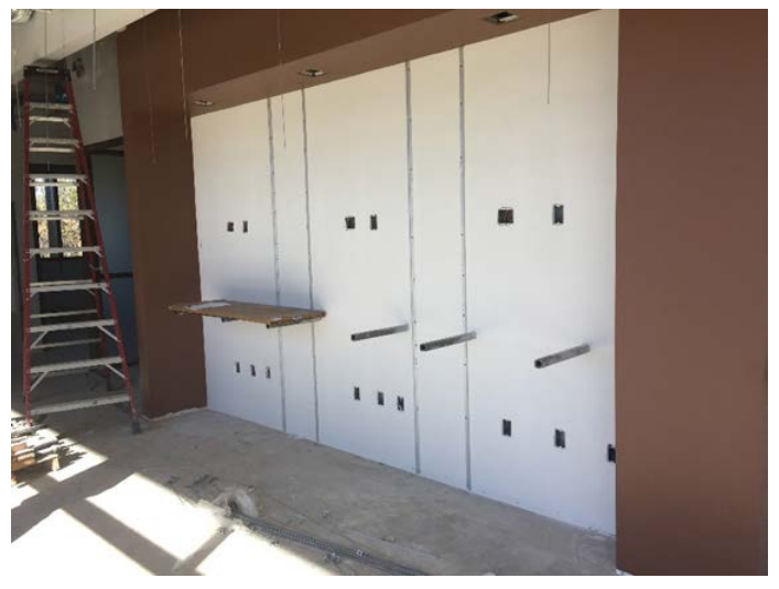
Computer Station on Second Floor