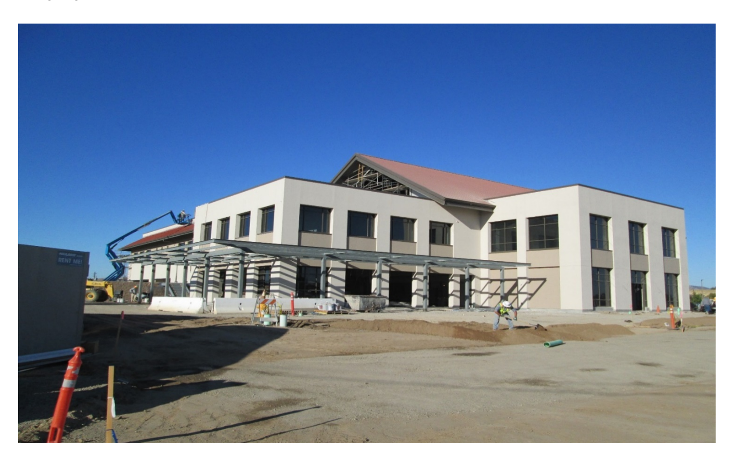
Northeast Elevation, Looking Towards the Cafeteria

In the upcoming month, all interior finishing work will continue. The Curtain walls are being installed. Walls are being closed up then textured followed by finish painting. Site work continues around the building.