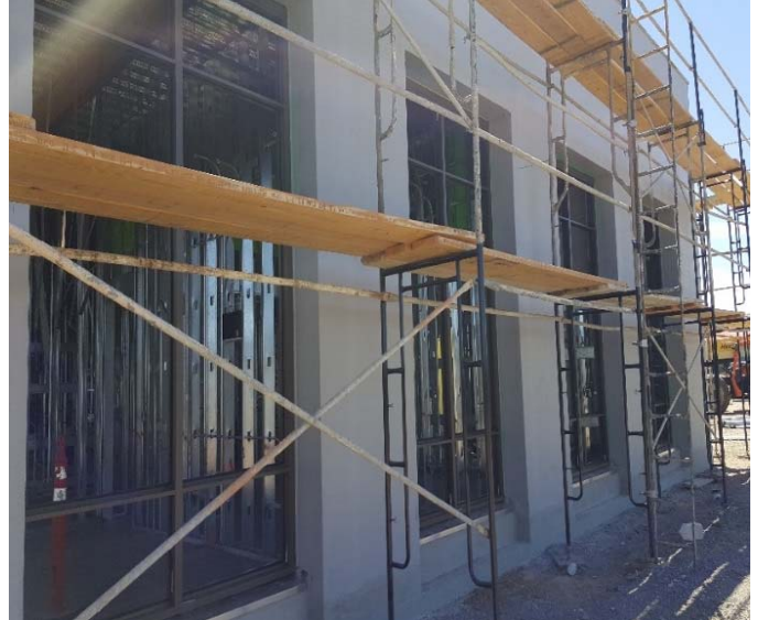
Window Installation on 1 st Floor