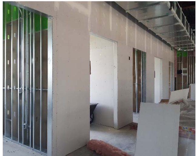
Drywall in Progress