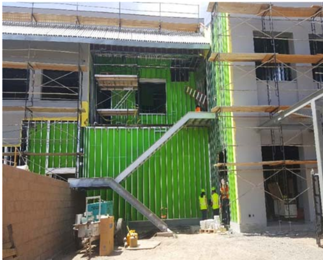
Exterior Framing and Sheathing at Stair 2

In the upcoming month, the contractor will begin roofing the high metal roof over the Main Entry. The project is currently on schedule with construction to be completed late fall 2017 and move-in scheduled in the winter and open for spring 2018.