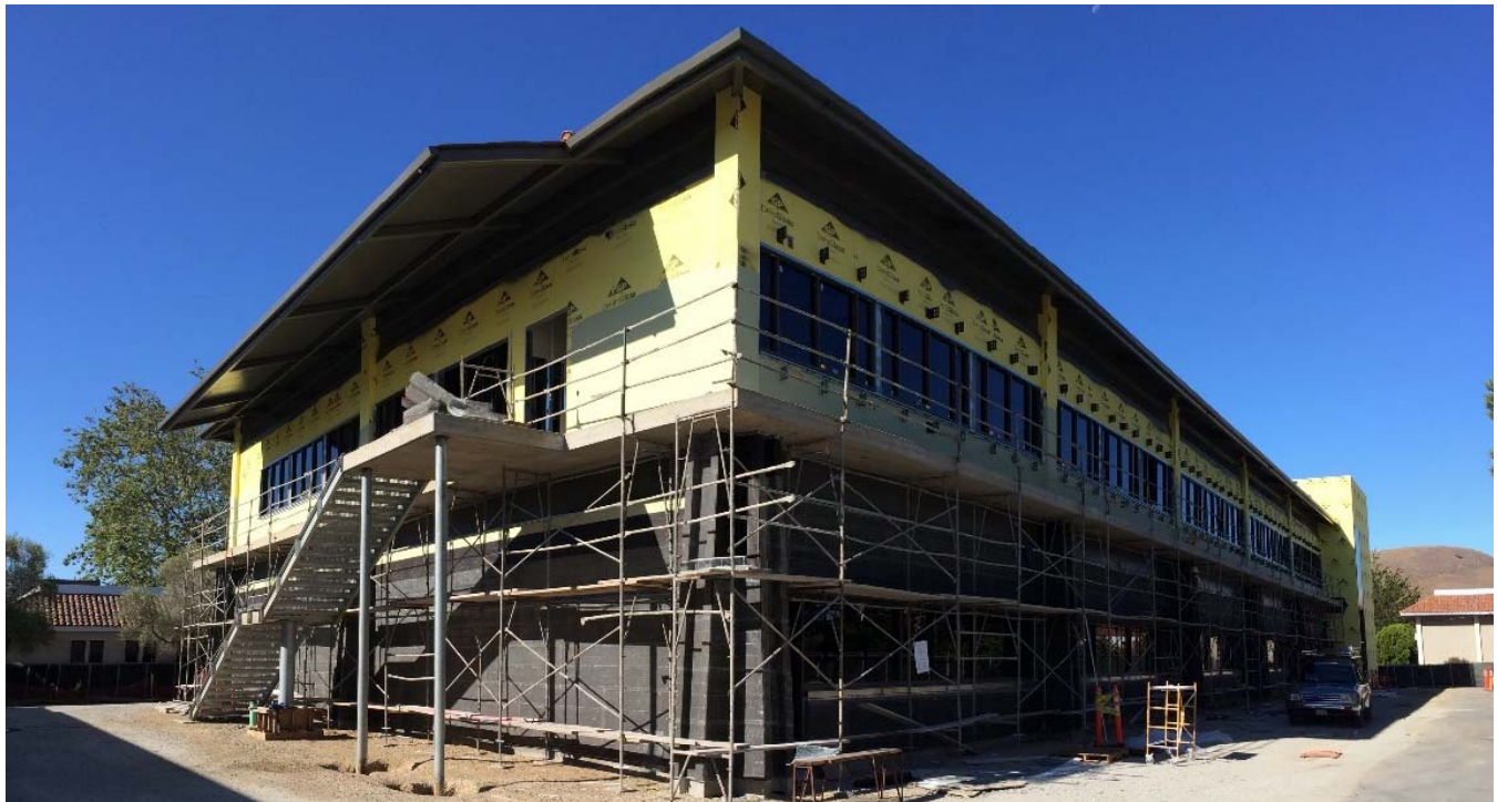
Exterior Progress from the Southeast Corner