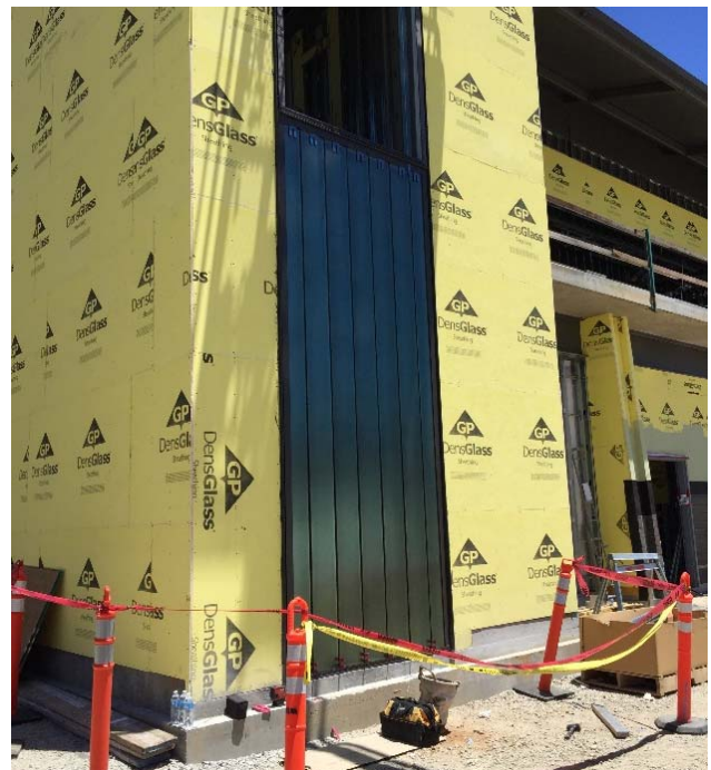
Channel Glass Installation at the Stairwell