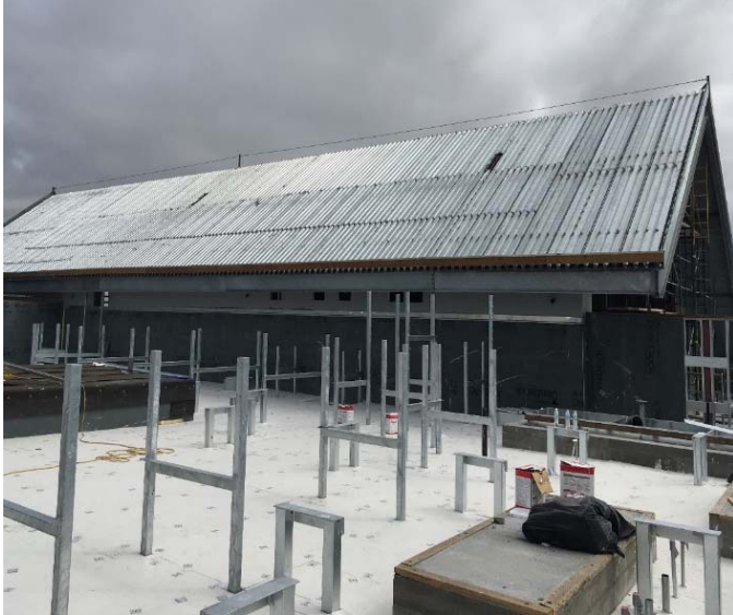
Exterior Framing and Sheathing at Stair 2