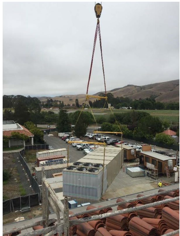
Hoisting of HVAC Units on the Roof