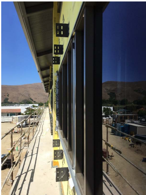
Second Floor Window & Frame Installation