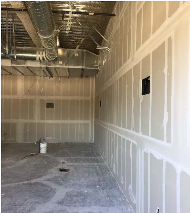
First Floor Classrooms Taping Progress

In the upcoming month, the project will begin several building milestones with the start of interior paint, acoustical ceiling grid and exterior plaster. The project is currently on schedule with construction to be completed late fall 2017 and move-in scheduled in the winter and open for spring 2018.