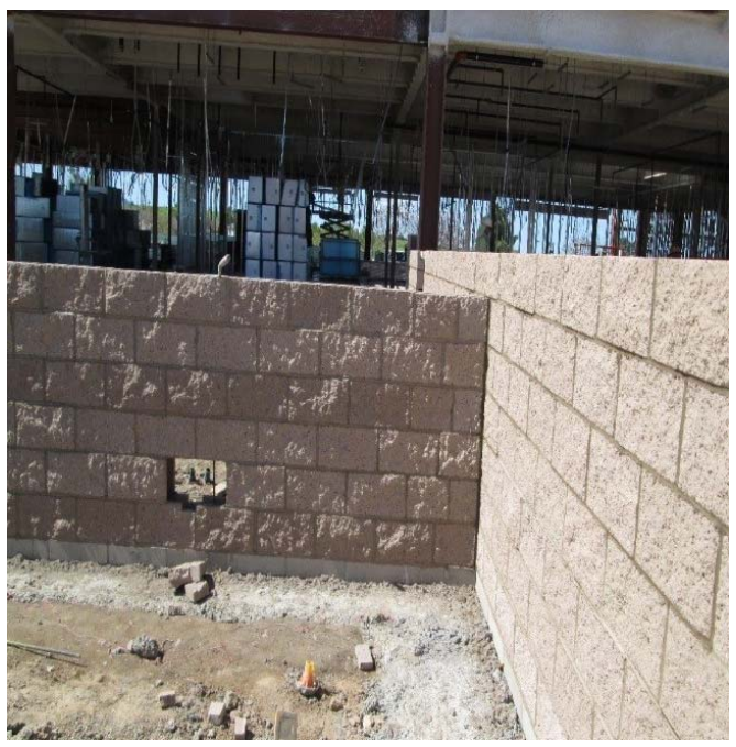
Concrete Masonry Walls