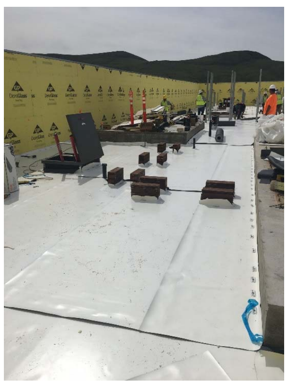
Single Ply Roofing Installation