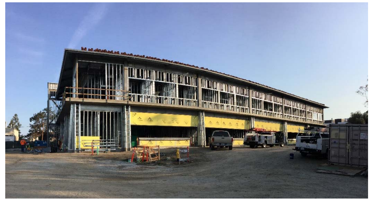
Framing and Sheathing Progress on the Southside of the Building