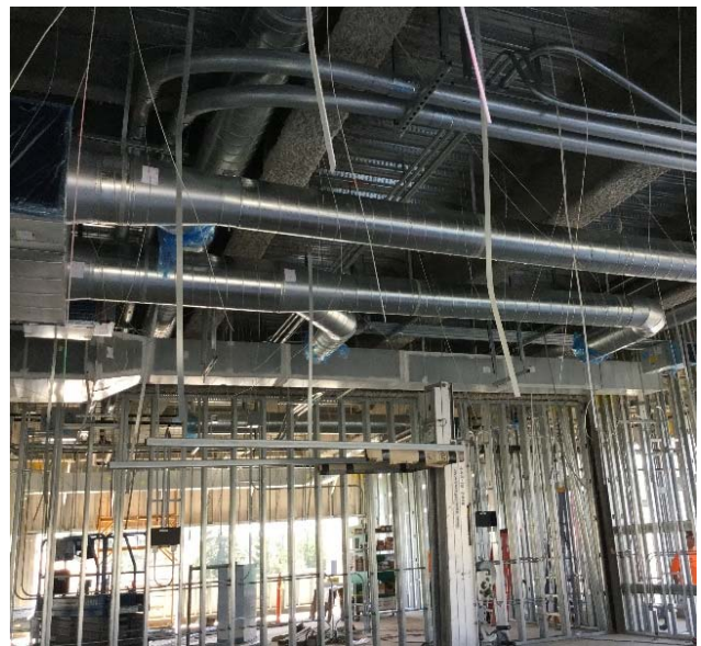
First Floor MEP Component Installation

In the upcoming month, contractors will continue with the roofing installation and exterior sheathing working towards the next major milestone of a watertight building. The project is currently on schedule with construction to be completed late fall 2017 and move-in scheduled in the winter and open for spring 2018.