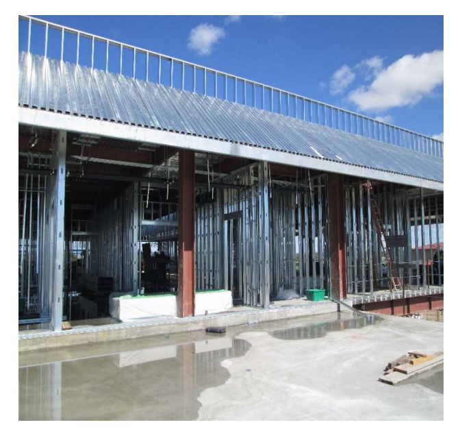
Interior Wall Framing

During the month of March, the Concrete Contractor completed the interior and exterior perimeter curbs. Also completed was the excavation, reinforcement and concrete placement for the Concrete Masonry Unit (CMU) wall footings. Towards the end of the month, the contractor started the CMU installation at the Equipment Yard and Fine Arts Patio. The Framing contractor continued with the interior wall framing and started working on the exterior wall framing. Fireproofing also commenced for both the first and second floors and will continue into next month. The exterior trellis work was completed and the MEP contractors have all commenced with the overhead rough-in.