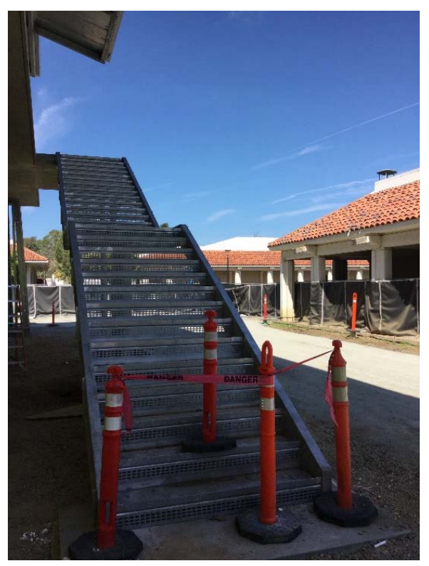
Installation of the Exterior Stairs