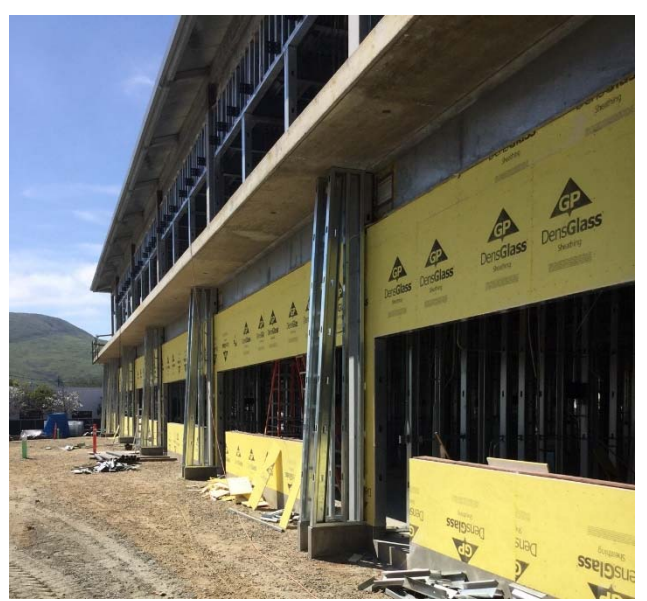
Sheathing at Exterior Walls