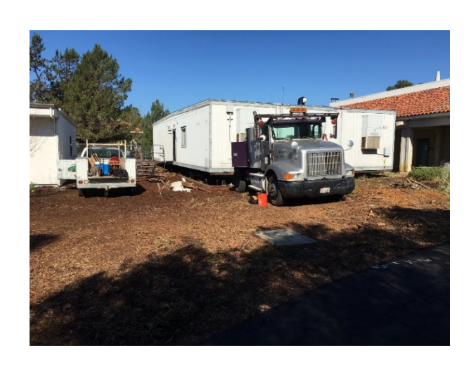
Portable Building Removal