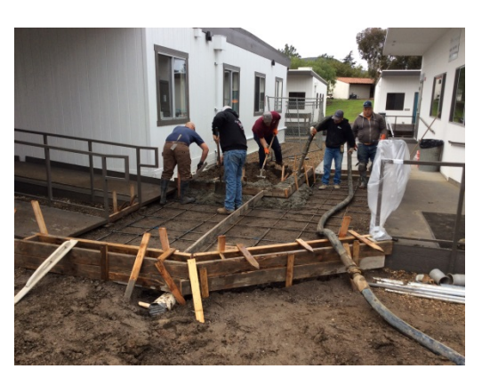
Placing Site Concrete