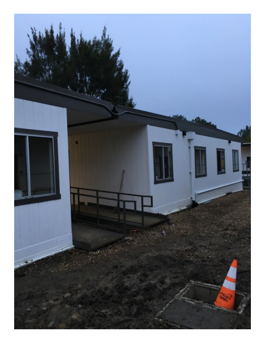
New Portable Buildings Prior to Site-work