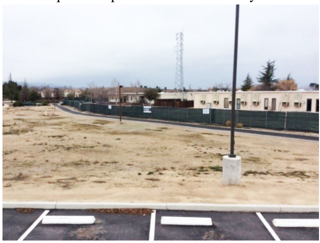
Temporary Walkway between Parking Lot 10 & 11

The parking stalls closest to the temporary student walkway from Parking Lot 10 (off Buena Vista Drive) to East side of campus are being converted into additional ADA parking stalls. MFPC began demolition of the existing walkway and vegetation on January 14, 2016 and began grading to achieve the ADA required slopes for the new walkway.