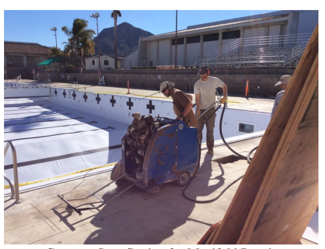
Concrete Saw-Cutting for Manifold Repair