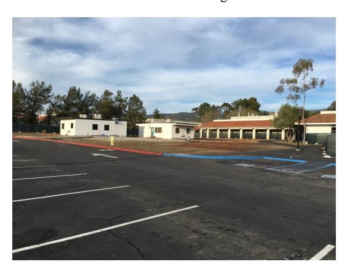
Remaining Portable Buildings