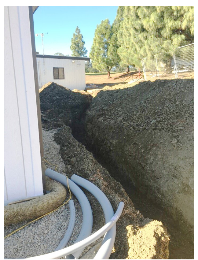
Site Trenching for Electrical Utilities

The paving contractor has completed the initial grading of the site in preparation to receive the buildings. Class Leasing has delivered and set the two portable buildings. The buildings have been fit with electrical and data systems. The remaining work prior to completion includes additional site grading to ensure proper drainage around the buildings and a few miscellaneous items required prior to the final punch-list walk.