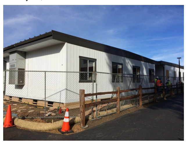
Setting of New Portable Buildings