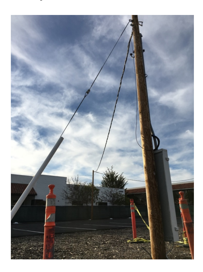
Temporary Construction Power

The project received DSA approval on 1/19/16. This project will initially go out to bid starting on 02/08/16 and bids will be opened on 03/10/16. Construction is anticipated to begin in April of 2016 and completed in the Fall of 2017.