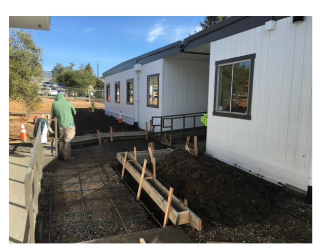
Installation of Rebar for Site Concrete