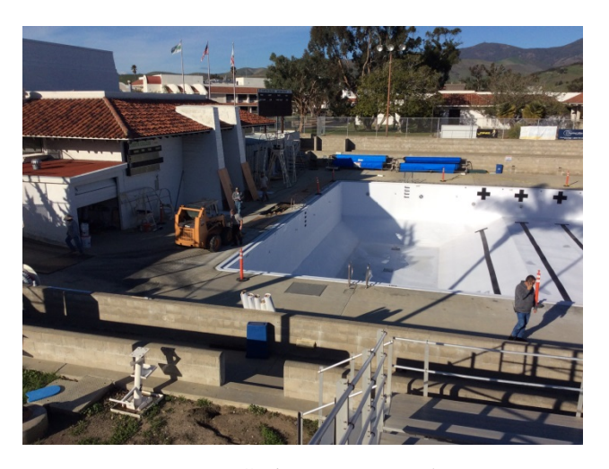
New PVC Liner at Deep End