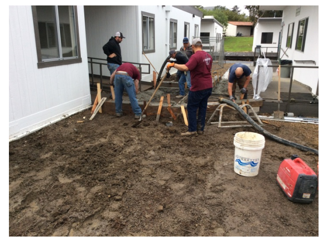
Installation of Rebar for Site Concrete

Through January of 2016, (5) Requests For Information have been submitted and (0) remain in review. The Contractors have submitted (11) submittals to the architect and (0) remain in review.