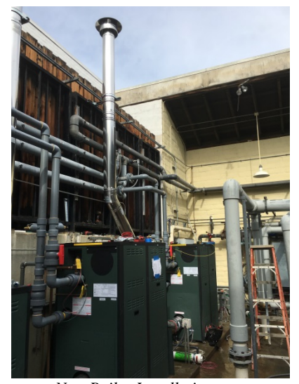
New Boiler Installation