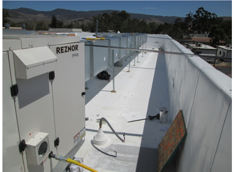
San Luis Obispo Campus – Building 4500 Roof