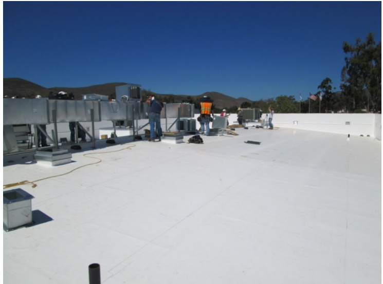
San Luis Obispo Campus – Building 1100 Roof