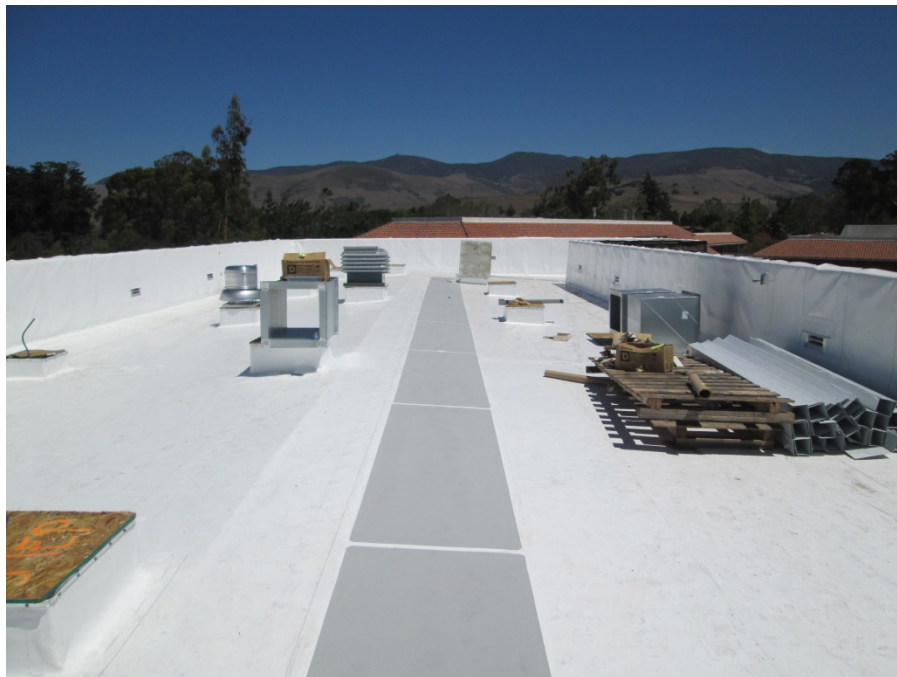
San Luis Obispo Campus - Building 4600 Roof