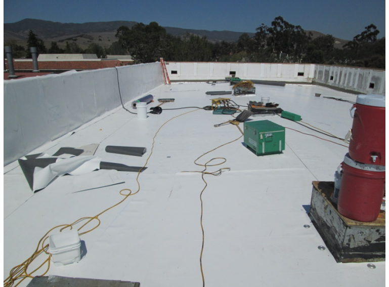
Roof Install – Building 4500