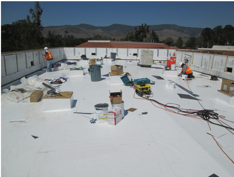
Roof Install - Building 4600