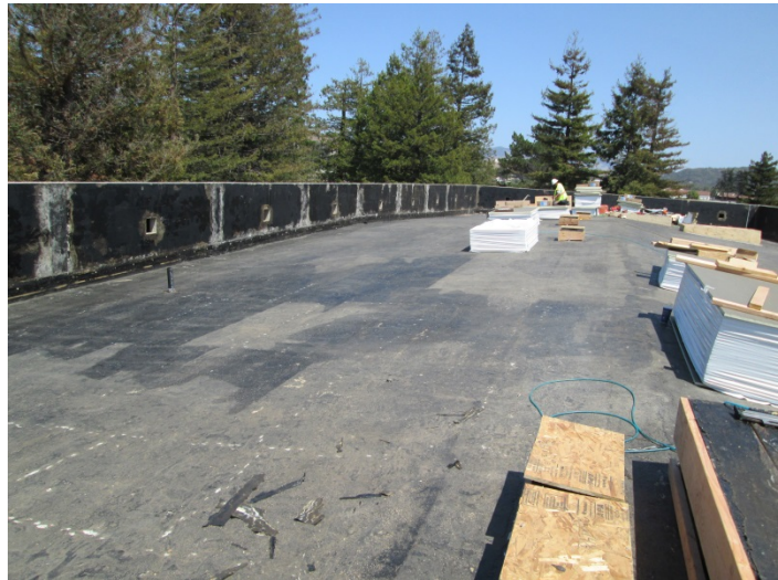
Demolition Complete, New Roof Install Begins - Building 1100