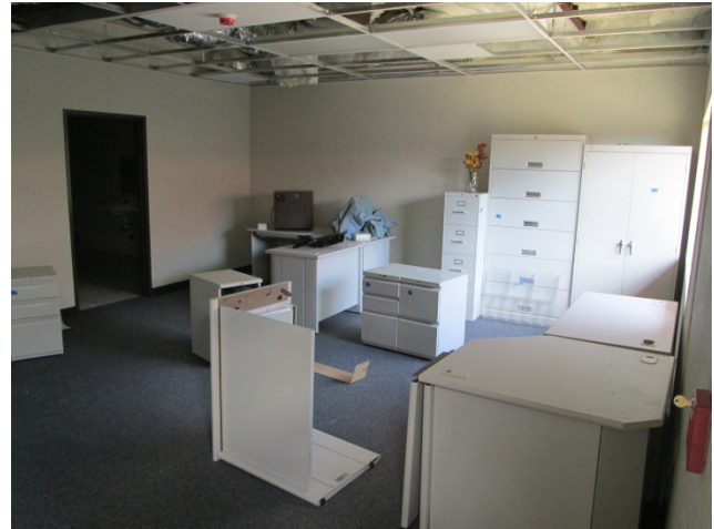
North Campus Health Center

Access: No access to fenced-off area Noise: Minor equipment noise Parking: None Utilities: None Odors: None Dust: Minor impact