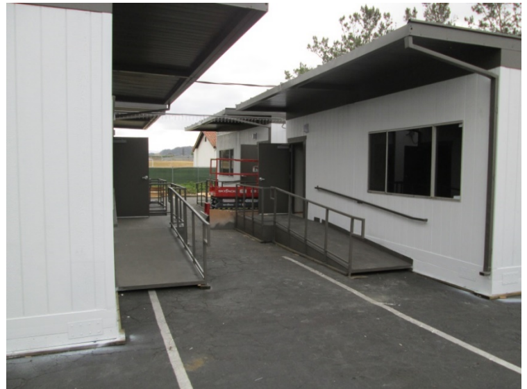
SLO Campus Classroom Portables