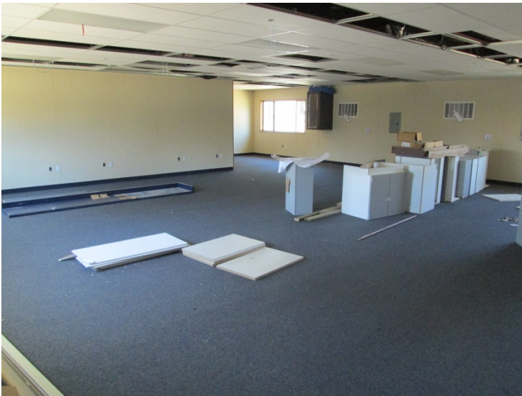
SLO Campus Public Safety Portable Building