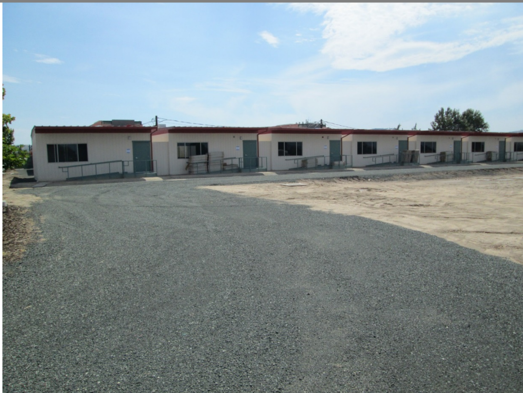
North Campus Interim Housing Project