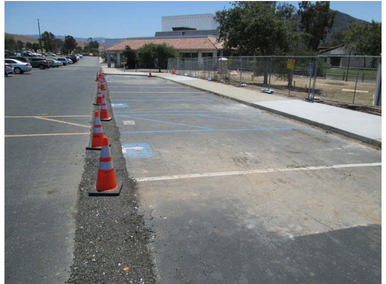
Public Safety Parking Lot ADA Stalls