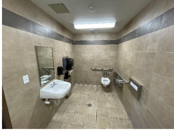
4200 Restroom - Finishes