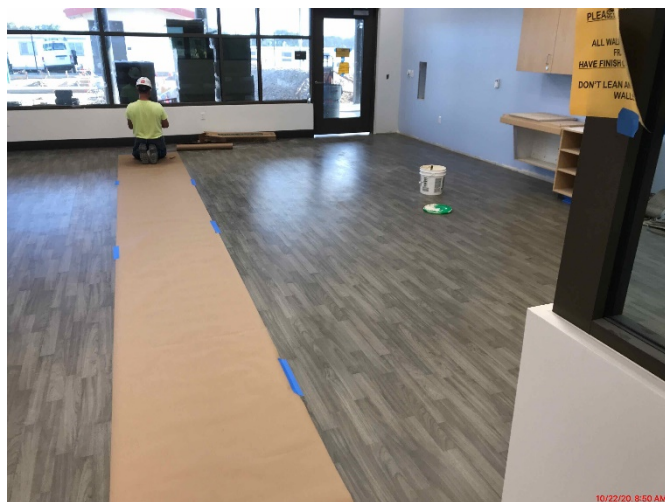
Children's Classroom Vinyl Flooring Installation