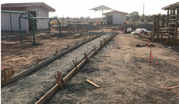
Play Yard Swing Frames, Structure and Trike Path Formwork

In the month of November, the contractor will complete the play yard construction with the installation of irrigation and turf, sand boxes, kids slides, outdoor deck, and fencing. On the interior, they will continue with the finishes, hanging all remaining doors, installing vinyl flooring and rubber base, window coverings, and countertops. The overall project remains on schedule to complete in fall of 2020.