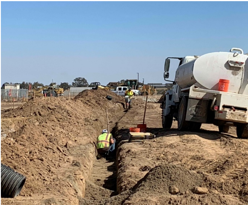
Site Lighting Excavation and Installation Progress