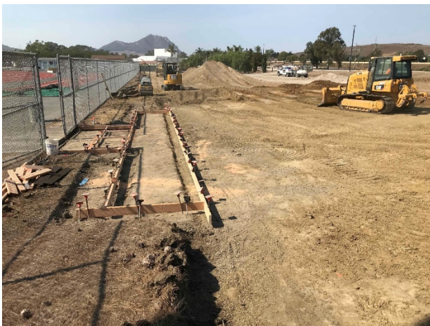
Parking Lot 1 Progress

Over the next month, the contractor will continue with the subgrade prep and new asphalt at Parking Lot 1. They will also perform the grind and overlay at parking lot 7 and parking lot 2. The project is on schedule to be complete by December 2020.