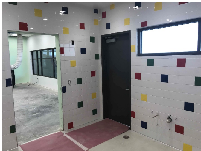
Children's Restroom Tile Installation Complete