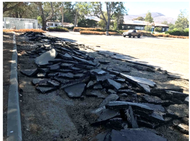
Parking Lot 2 Progress