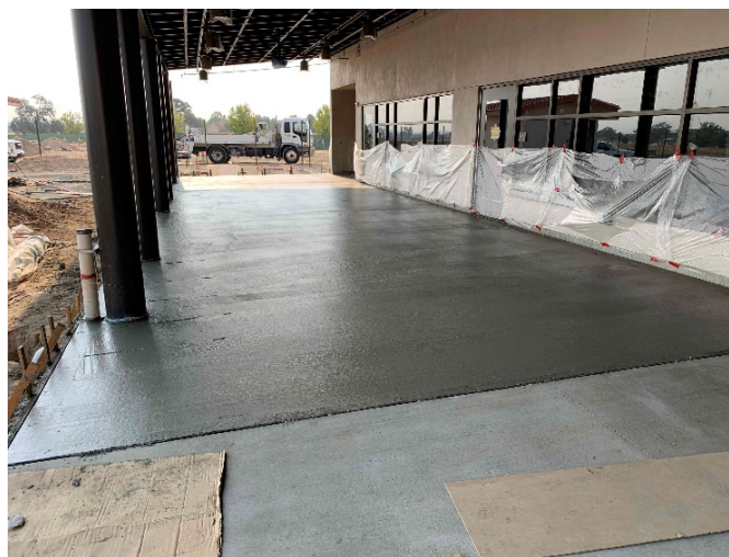
Concrete Complete at Covered Play Area