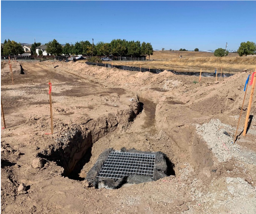
Underground Storm Drain Installation Complete