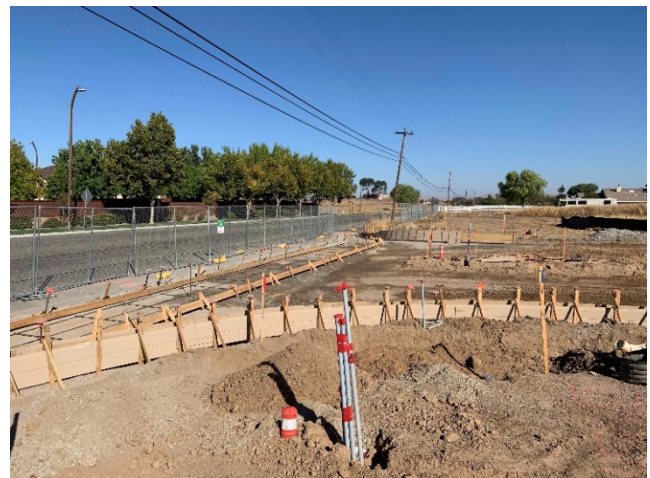
Formwork at New Main Entry at Buena Vista