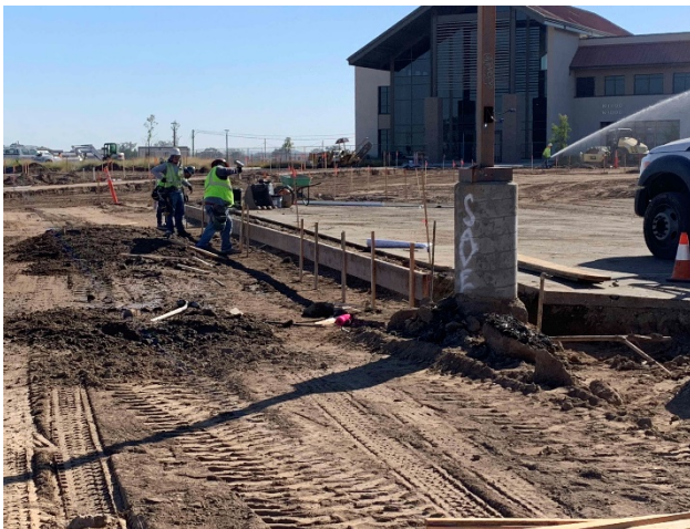
Formwork for New Main Entry Drive Aisle

Over the next month, the contractor will continue with the formwork for all the site curb and gutters and the installation of the site lighting and irrigation. They will also begin the construction for the main entry walls and prep for new asphalt. The project is on schedule to be complete by December 2020.