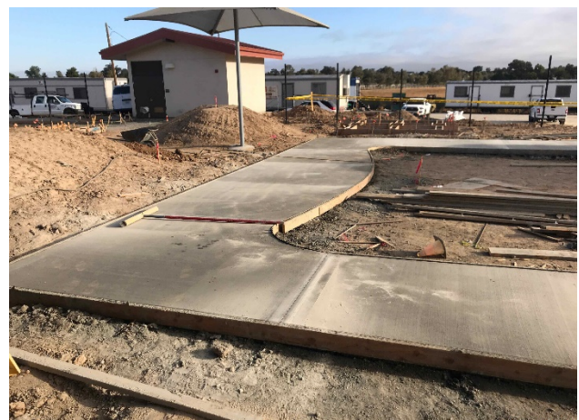
Play Yard Trike Path Concrete Progress