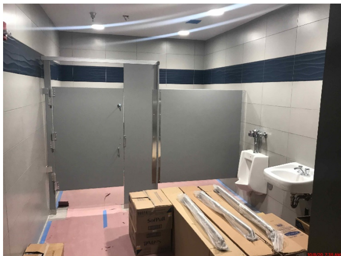
Faculty/Staff Bathroom Progress