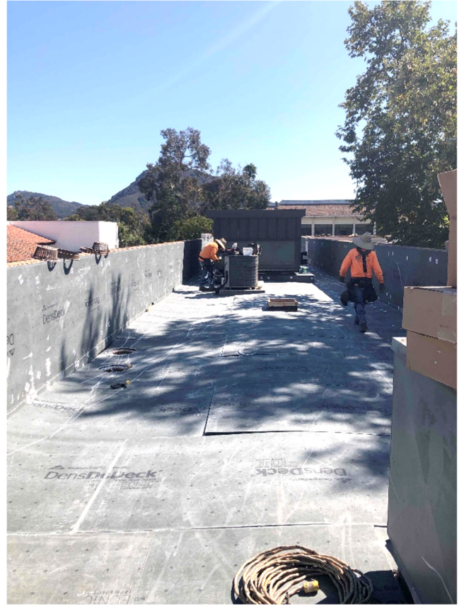
New Roof Installed on Buildings 4400 and 6200