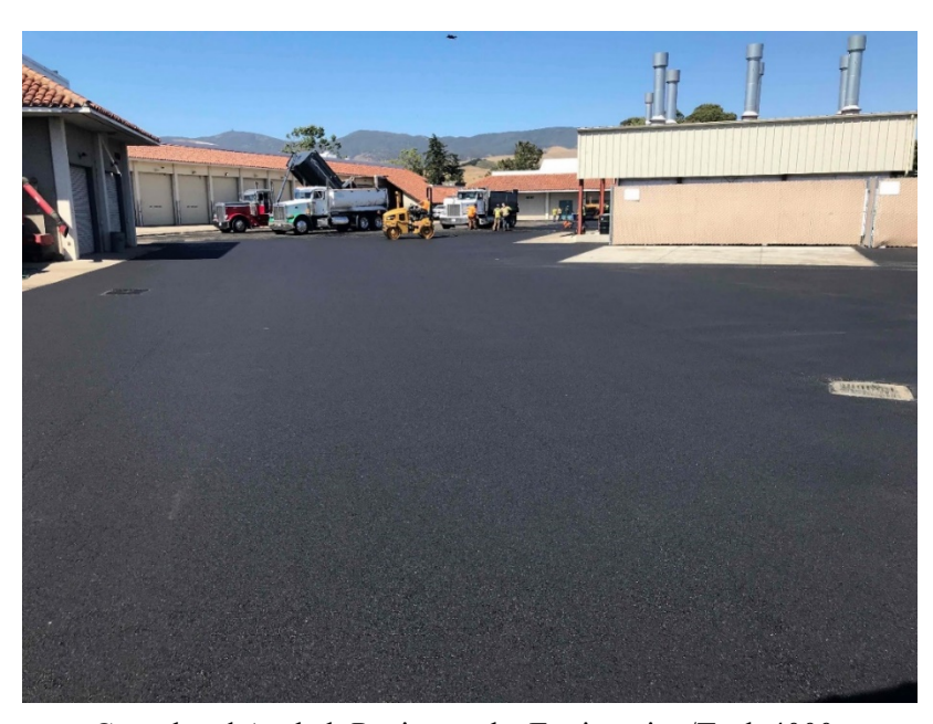
Completed Asphalt Paving at the Engineering/Tech 4000s Complex Yard