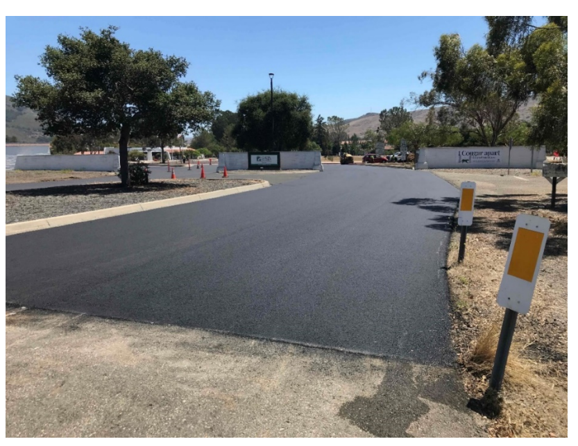
Completed Asphalt Paving at the Education Drive Entry/Exit