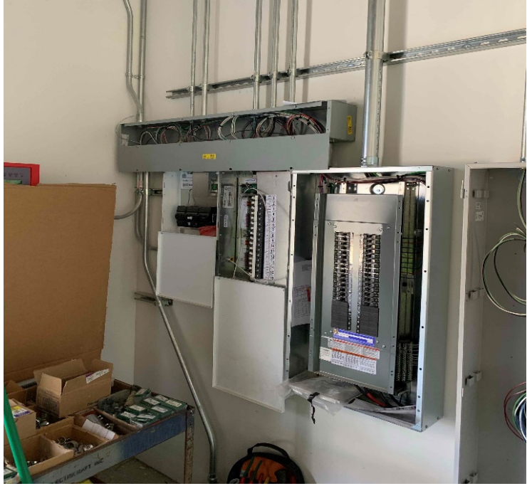
Electrical Controls and Breaker Installation Progress