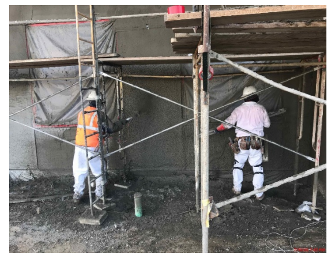
Exterior Plaster Progress

During the month of July, the contractor completed the scratch and brown coat of the exterior plaster system, the finish coat will be complete in early August. The membrane roof in the mechanical well is complete allowing for the last few standing seam metal roof panels to be installed in the upcoming week. Installation of the ceiling grid is complete and fire sprinkler drops have been installed, the tiles will be installed once the mechanical register and ceiling lights are installed. Pulling of communication cables is complete and electrical controls and breakers are nearly complete. Also starting this month was the installation of exterior site lighting.