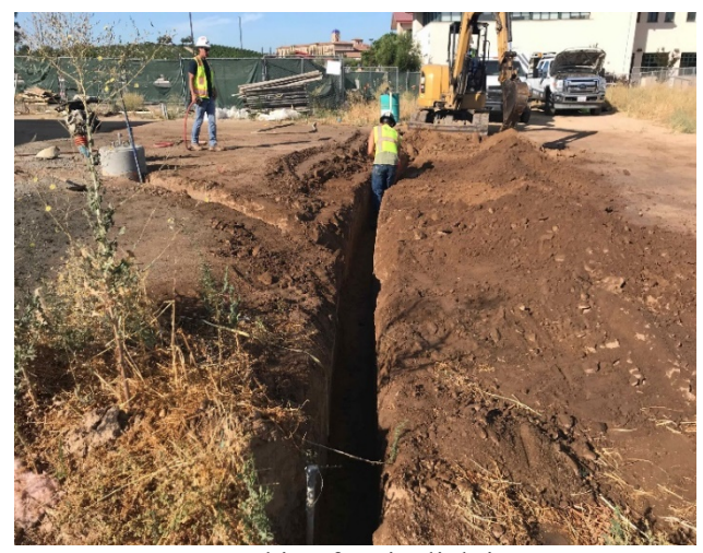
Trenching for site lighting

In the month of August, the contractor will complete the installation of the exterior plaster system and commence the exterior play yard survey and grading activities. On the interior of the building, the contractor will begin installation of the casework and tile in the restrooms. The overall project remains on schedule to complete in fall of 2020.