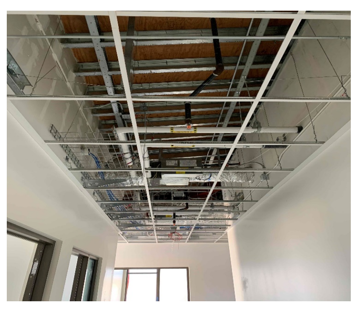
Installation of T-Bar Grid is Complete