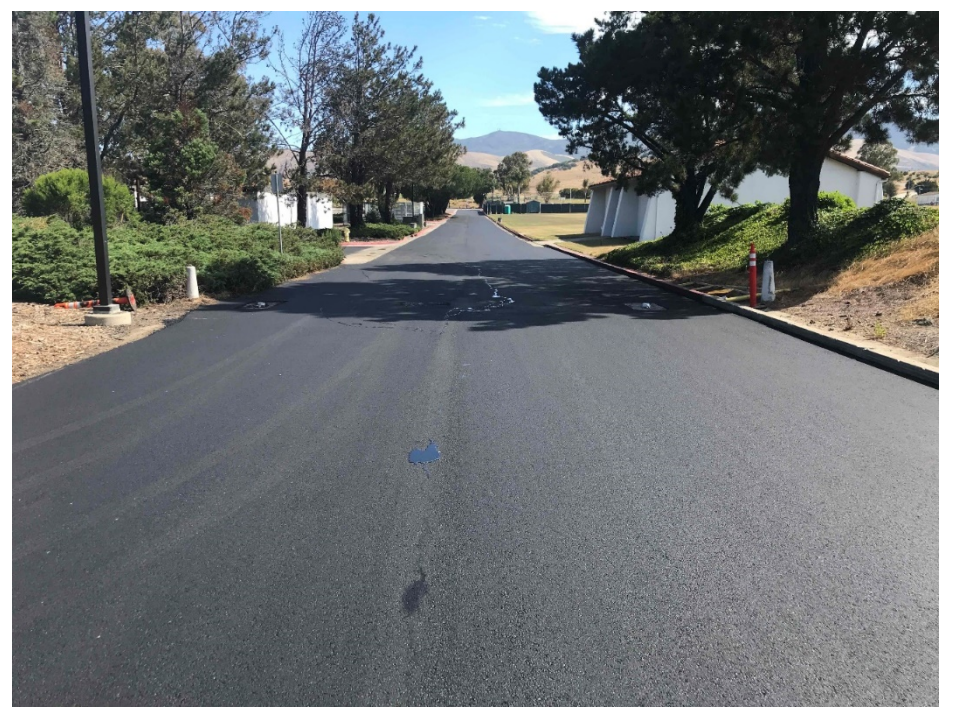
Completed Asphalt Paving of the Service Road

The project is currently on schedule and is anticipated to be complete by August 14, 2020, prior to the start of Fall semester.