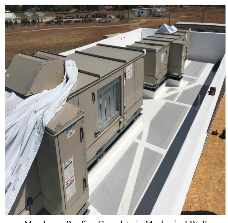
Membrane Roofing Complete in Mechanical Well