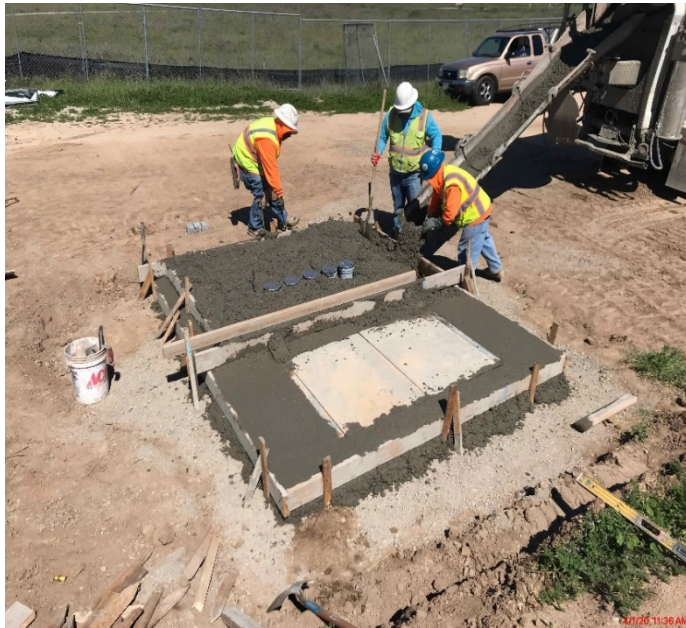
Electrical Equipment Pad