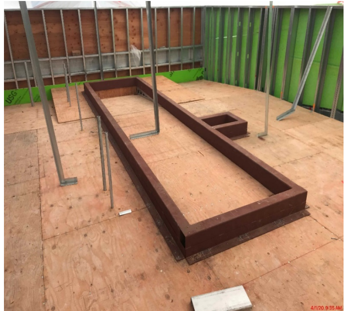
HVAC Equipment Curb Installation Progress