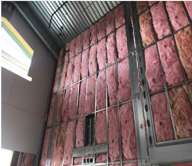
Insulation Installation Progress

In the upcoming month, interior drywall and insulation will continue as well as the installation of exterior windows. Following the window installation, the contractor will begin the installation of the exterior lath and plaster system. The overall project remains on schedule to complete in fall of 2020.