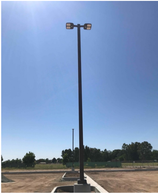
Parking Lot Light Poles