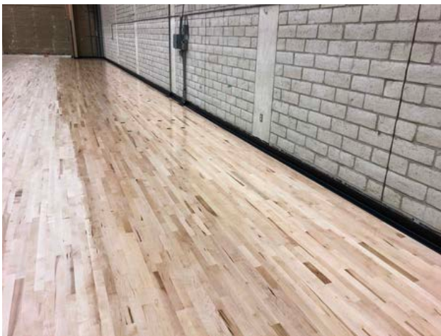
Sealed Flooring Behind Bleachers

Over the next month, the contractor will finish all sanding, sealing, and striping of the newly constructed gym floor. The District will perform annual bleacher maintenance and cleaning prior to the completion of the project. The project is currently on schedule.