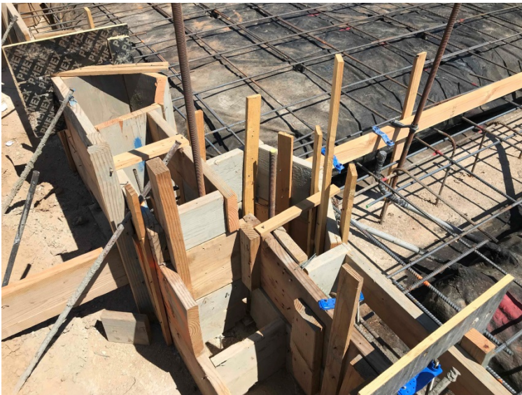
Slab Formwork and Blockouts