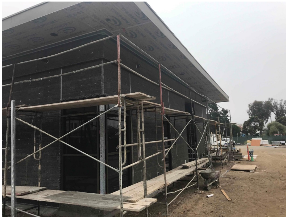
Data Center Exterior – Paper and Lath

In the upcoming month, the General Contractor will load the roof allowing plaster on the exterior of the building to be installed. Interior drywall and finishes will also continue and tile and paint finishes will begin. The project is still on schedule with construction to be complete in Fall 2019 and open for Spring 2020.