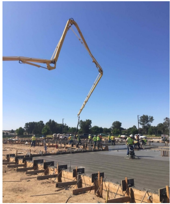
Building Slab Pour