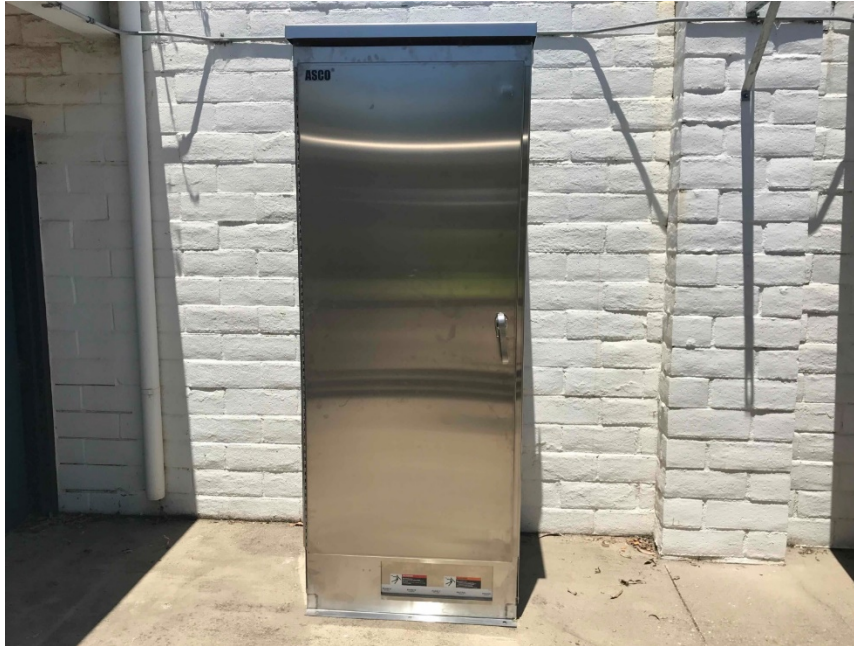
New Manual Transfer Switch