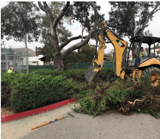
Demolition at New Pad Site

The project has received an early start for the preliminary work and is currently on schedule to complete with the campus wide shutdown on December 26 th -28 th , 2019..