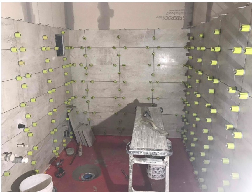
Restroom Tile Installation