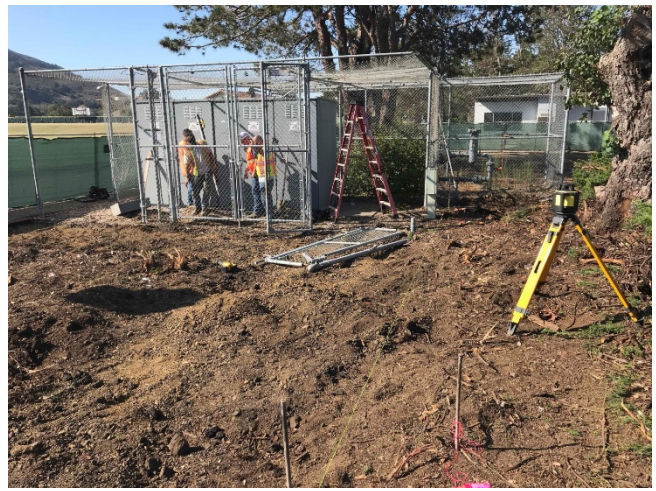
Preliminary Investigative Work