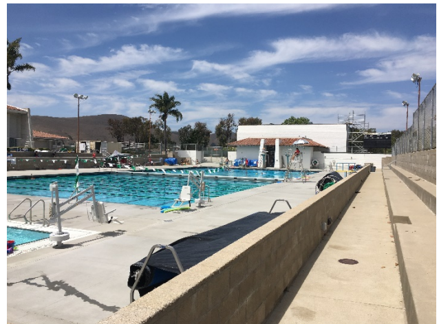
Completed Pool – Lap Swimming