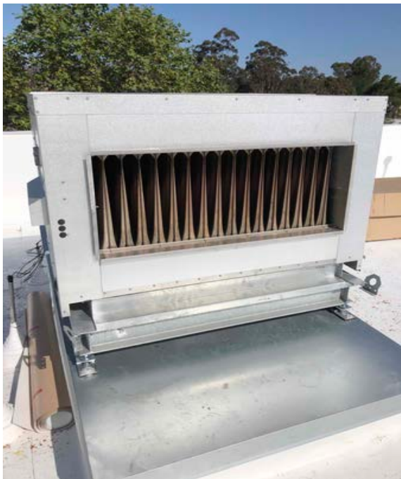
New HVAC Units Installed

In the upcoming month, the building 1200 HVAC units will be hooked up with new electrical and controls. Once the connections are in place, the units will be functionally tested and commissioned. The project is currently on schedule to complete early August 2019.