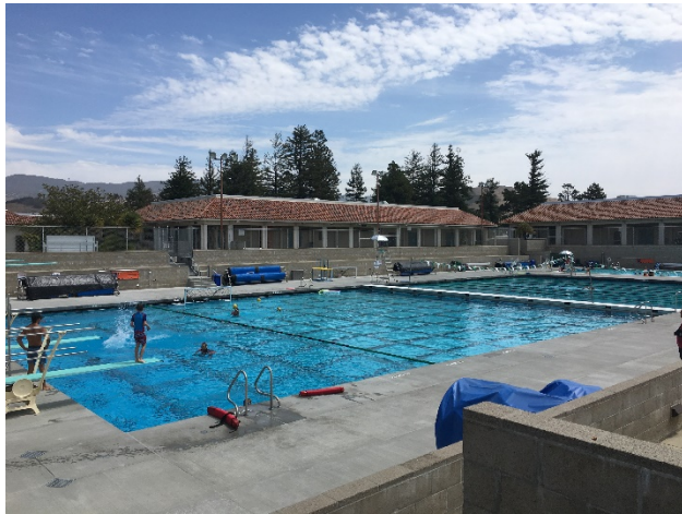
Completed Pool – Diving End

In the upcoming month, the District will continue to complete the pool deck restroom drawings and then submit to DSA. Once DSA approval is received, construction on the drop-in restroom structure will commence.