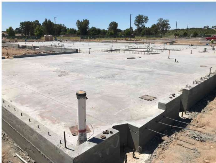
Building Slab Installation

In the upcoming month the parking lot will be paved, striped, and turned over to the district for use. Steel erection will continue with framing to follow. The overall project remains on schedule to complete in June of 2020.