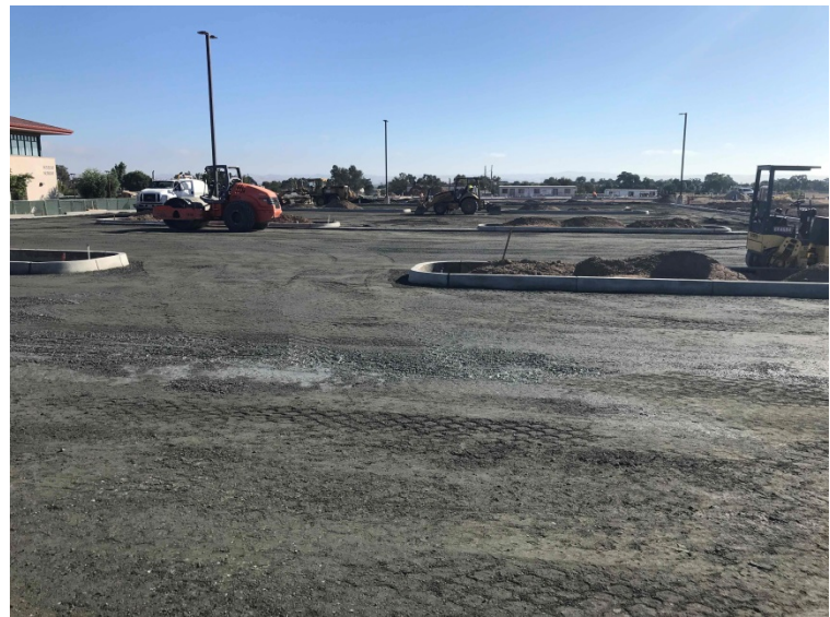
Parking Lot Base Rock