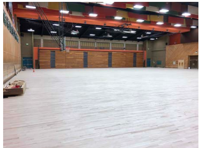
New Gym Floor Installation