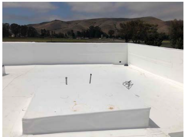
New Roofing and HVAC Curb Installation.