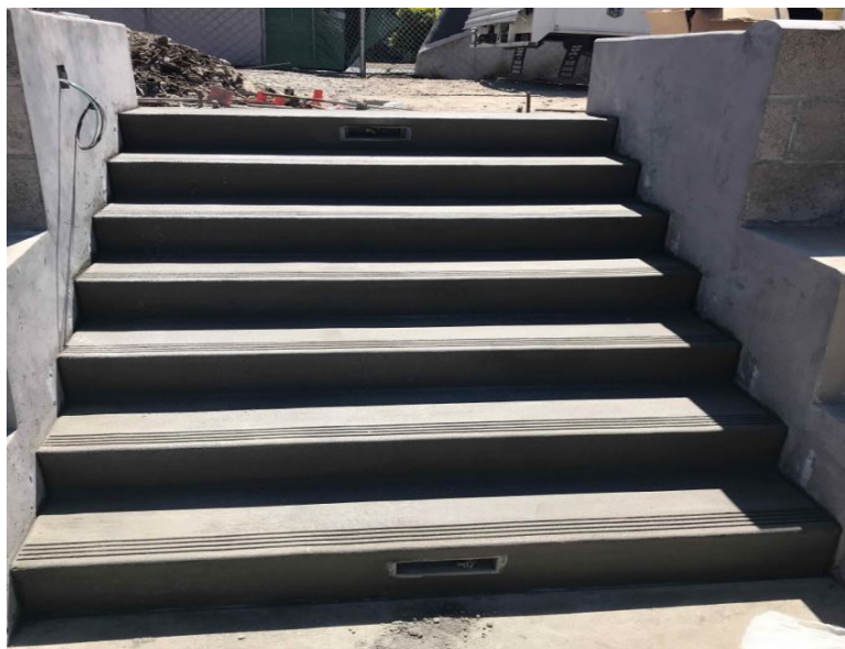
South Side Stairs at Pool Site