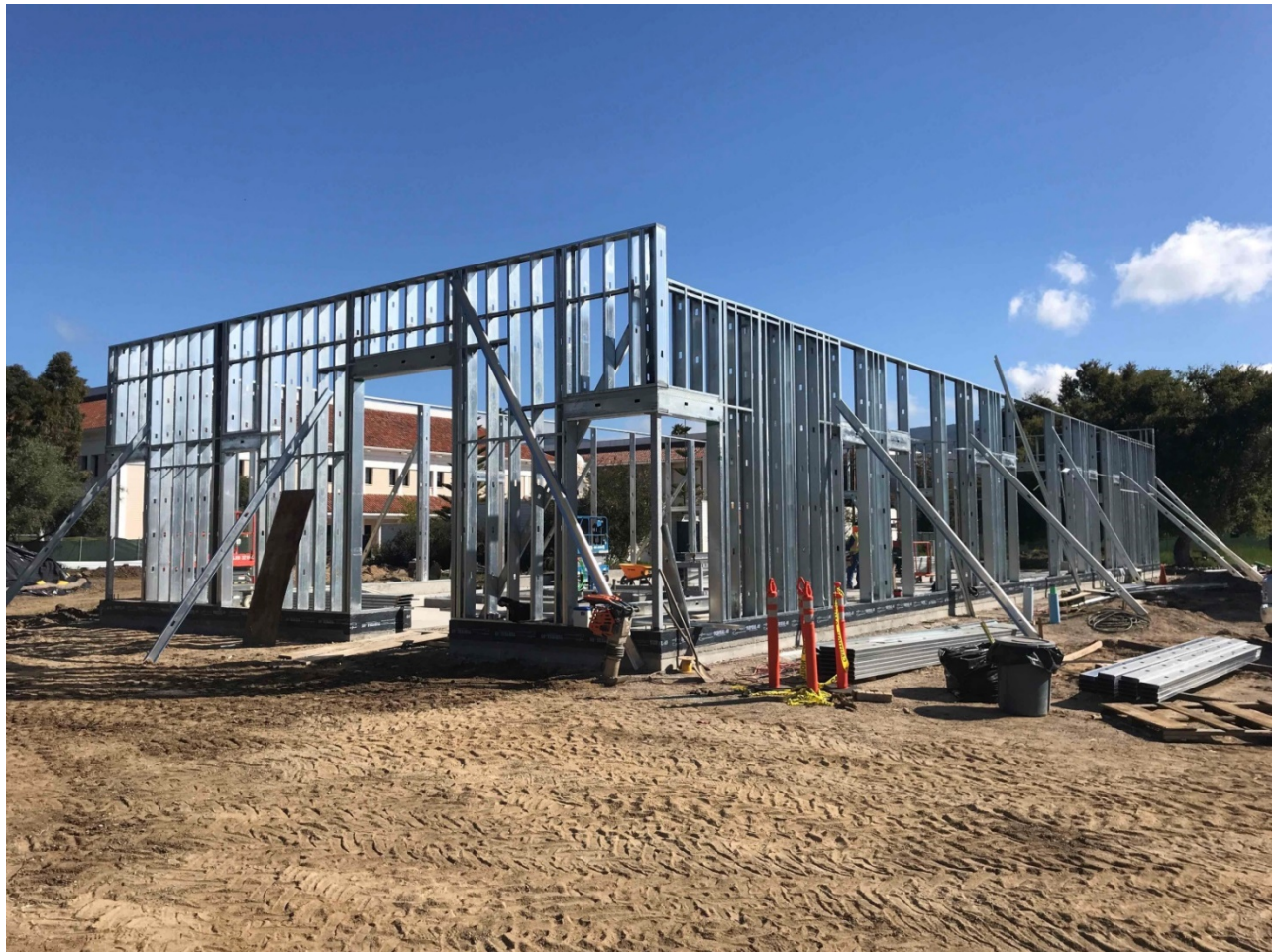
Cold Metal Framing

In the upcoming month, the General Contractor will complete the framing and begin the rough ins of the plumbing, duct work and electrical. The project is still on schedule with construction to be complete fall 2019 and open for spring 2020.