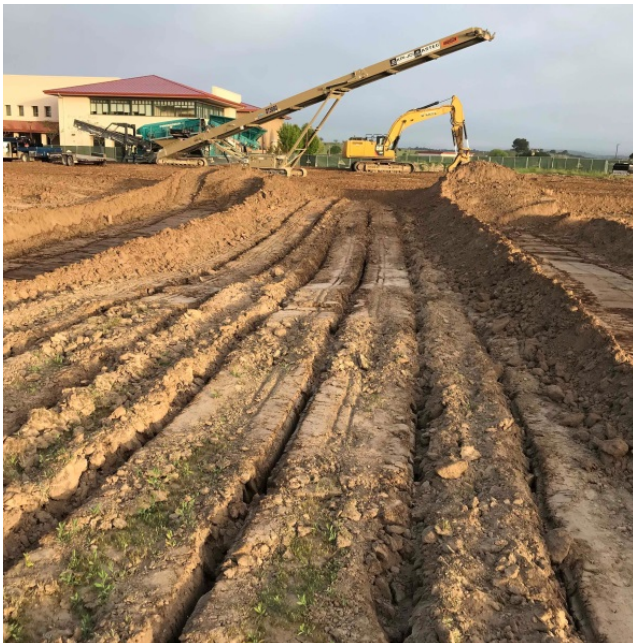
Site Grading Progress

In the upcoming month, the General Contractor is anticipating the commencement of work on the curbs, gutters, asphalt, lighting and landscaping for the parking lot. The footings for the building and concrete reinforcement is scheduled to commence in May. The parking lot is scheduled to be completed and available for use early summer 2019 with an overall project completion of fall 2020.