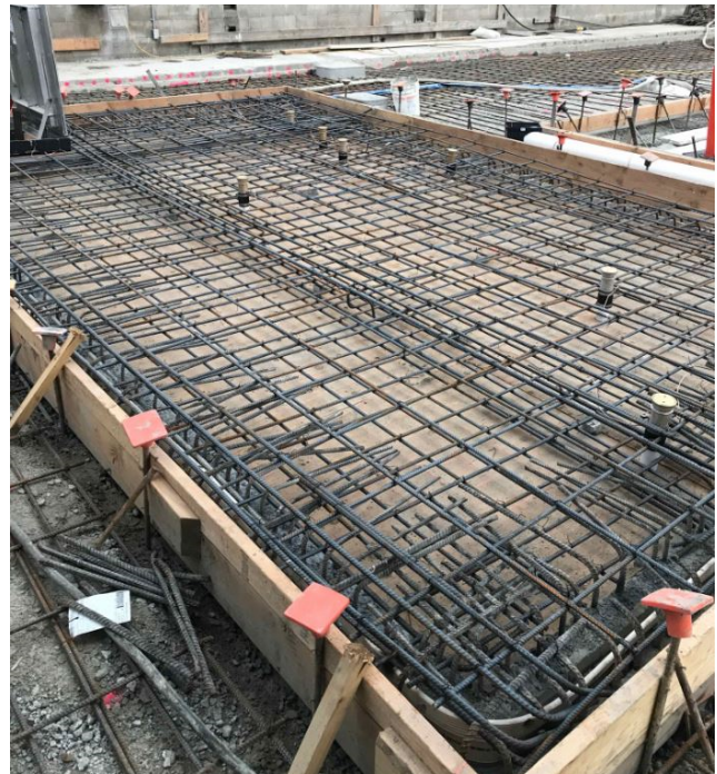
Reinforcing Steel at Competition Pool Surge Tank