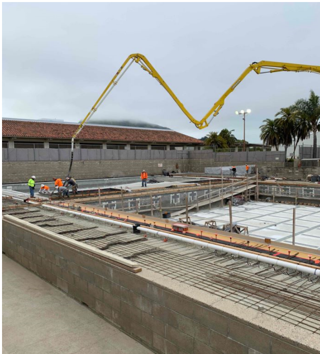
Pouring of the Pool Deck

In the upcoming month, the Contractor will continue placing reinforcing steel and pouring concrete at the pool deck. Door hardware upgrades in the 1400 Building will continue into May. Plastering of the competition pool and training pool is anticipated to begin. The completion of the Aquatics Project is anticipated for May 2019.