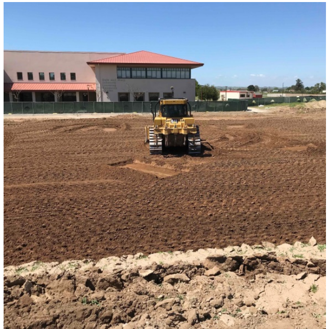
Site Grading Progress