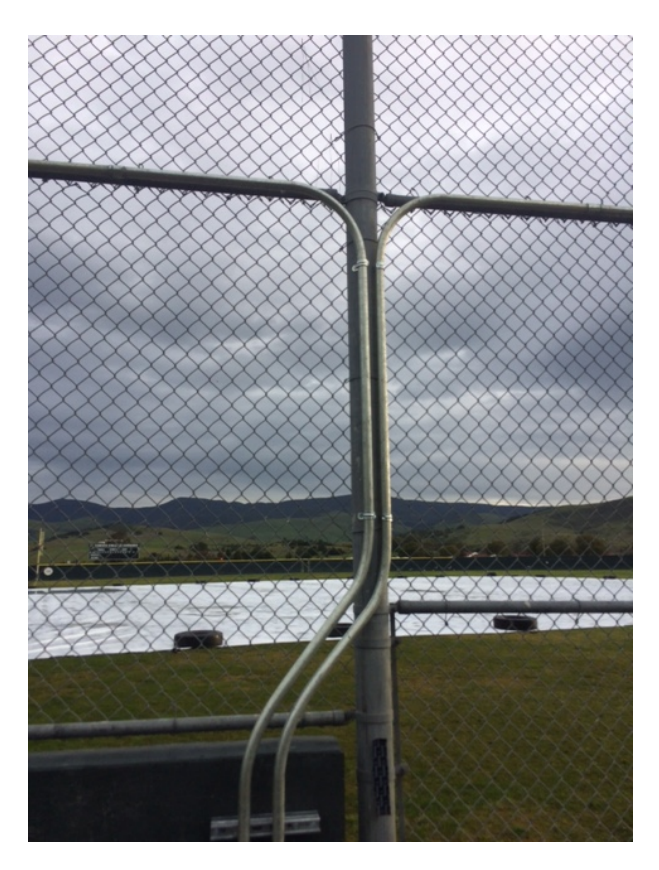
New Conduit Installed for Baseball Field WiFi

In the upcoming month, the electrical contractor will pull/terminate data and install access points (APs) in buildings 9100/9200. They will also install outdoor APs at the softball field and track. The project completion is anticipated by the end of April 2019.