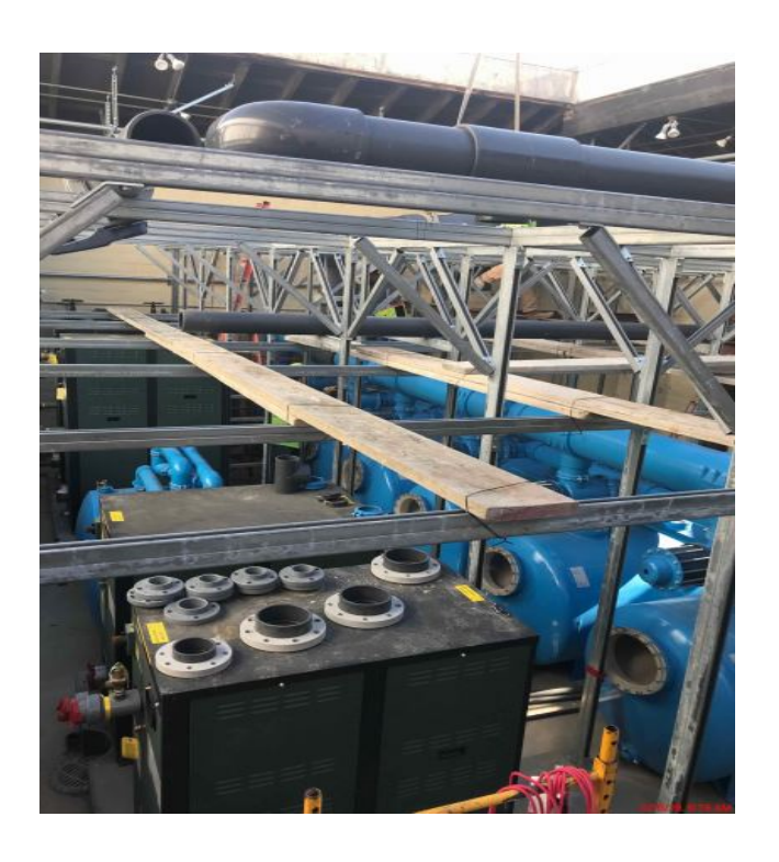
Pool Equipment Room Install Progress

In the upcoming month, the work on forming the concrete for the cantilever pool deck continues with the steel reinforcing and concrete placement scheduled to commence. Door hardware upgrades in the 1400 building and work in the pool equipment room will continue into next month. The completion of the Aquatics Project is anticipated for May 2019.