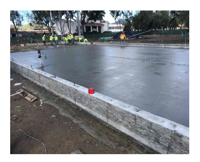
Placement of Concrete Slab on Grade

In the upcoming month, the General Contractor is on schedule to complete the framing, install the natural gas line to the new generator and install the storm drain line. The project is still on schedule with construction to be complete fall 2019 and open for spring 2020.