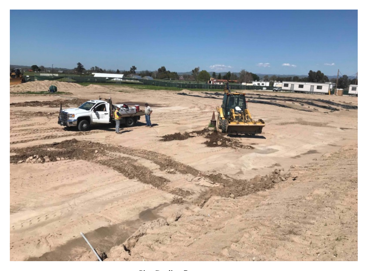
Site Grading Progress

The site grading will continue into the upcoming month followed by the excavation and installation of underground utilities. The parking lot is scheduled for completion in spring 2019 with an overall project completion of fall 2020.