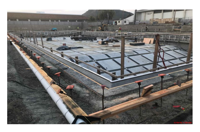
Competition Pool Gutter and Slat Drain Progress