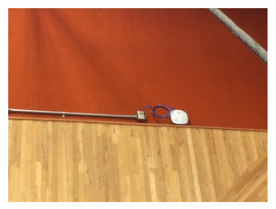
New Wireless Access Point in Building 1400