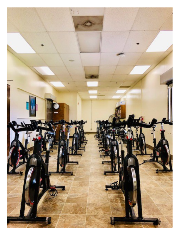
New Wireless Access Point in Building 1100