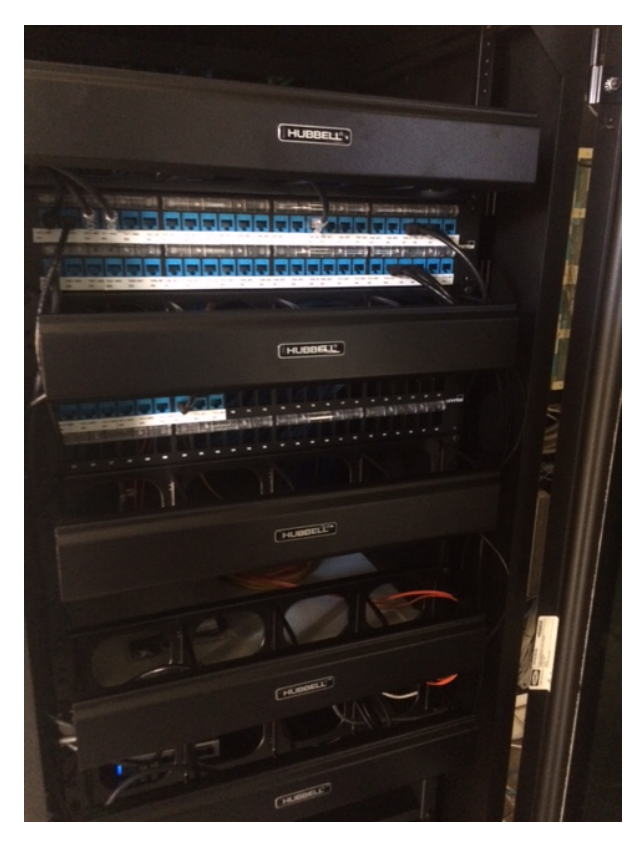
New Rack Installed at 7400/7500

During the month of March the electrical contractor completed the switch over of building 7400/7500 to the new equipment. They have also completed the conduit routing for the new WAP locations at the baseball field.