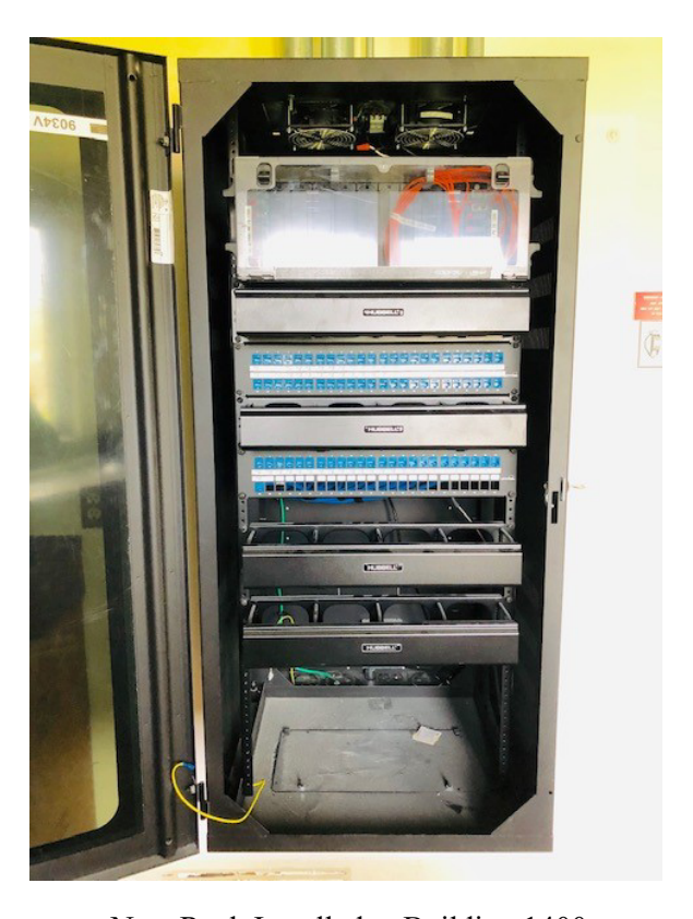
New Rack Installed at Building 1400