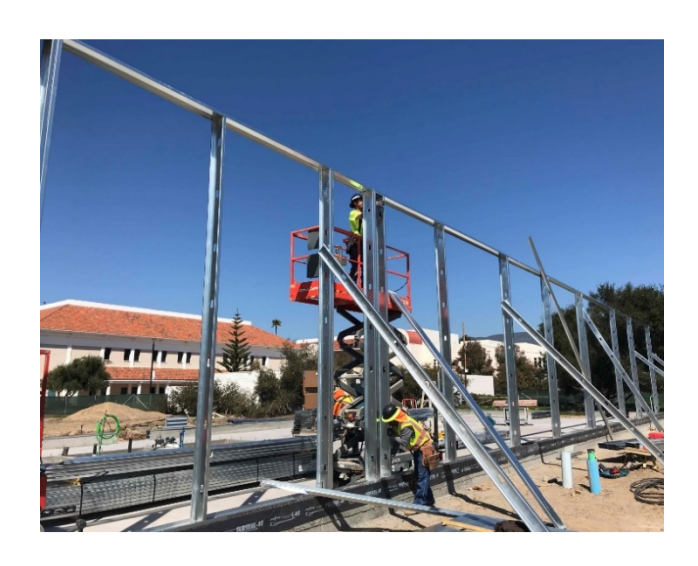
Start of Light Gage Metal Framing